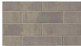
"CLOUDBURST" SMOOTH STONE