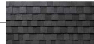
"2 TONE BLACK" ASPHALT SHINGLES