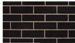
"ESPRESSO" FACE BRICK