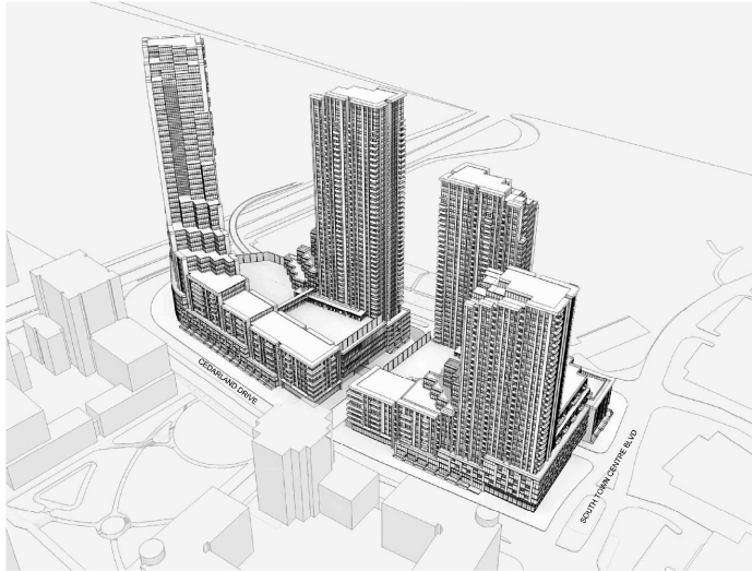
2 A001 AERIAL VIEW LOOKING SOUTHEAST PERSPECTIVE