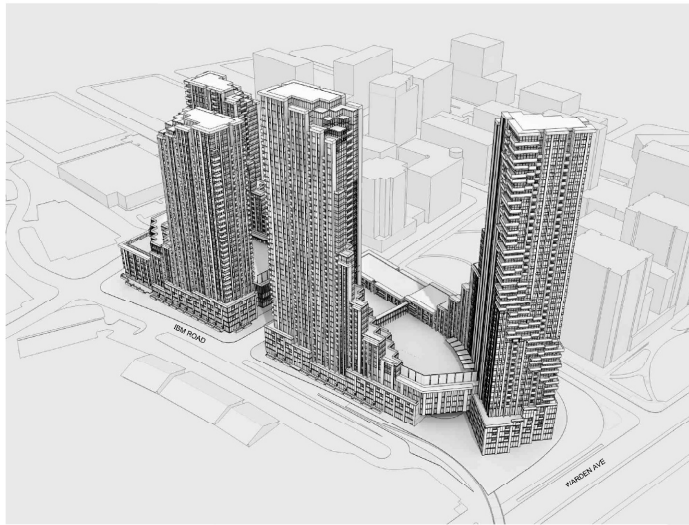
4 A001 AERIAL VIEW LOOKING NORTHWEST PERSPECTIVE