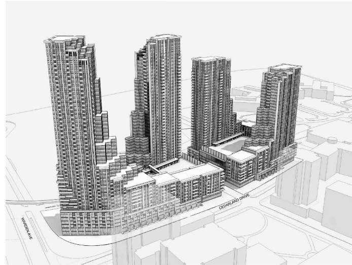
1 A001 AERIAL VIEW LOOKING SOUTHWEST PERSPECTIVE