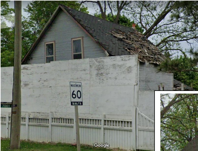
Roof Issues on east and west roof slope

North Elevation (Front) - Roof Issues on west roof slope