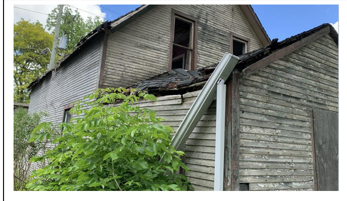
Rear tail of building- roof collapse (Heritage Section Photo)

North Elevation (Front) - Roof Issues on west roof slope