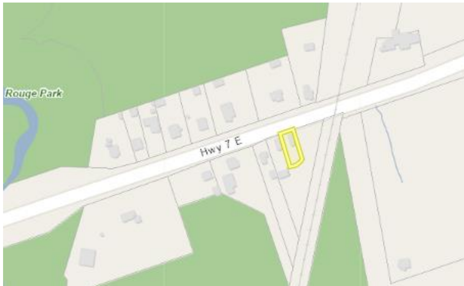
Figure 1 – Location