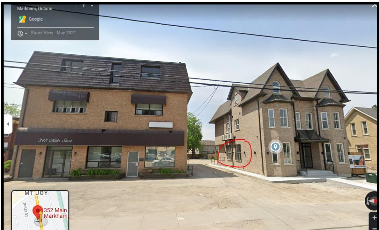
APPENDIX B- PHOTOGRAPH OF THE BUILDING AT 352 MAIN ST. N.