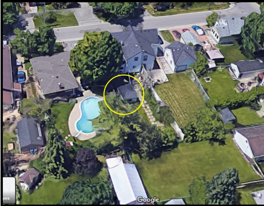
Exterior and Interior Photographs of the accessory building at 45 Jerman Street