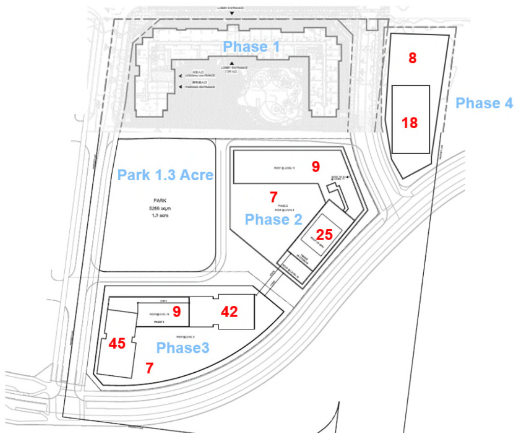
Figure 1 – Kingdom Revised Concept Plan

It is our view that the Preferred Development Concept to be presented to Development Services Committee on July 5, 2022 does not accurately reflect the ongoing discussions with staff as it relates to the Kingdom site and we would therefore recommend the following: