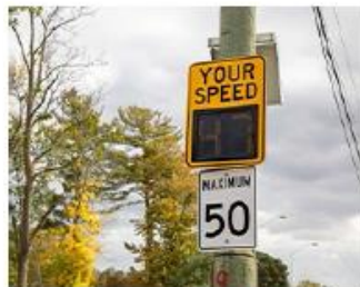
Speed Radar Display Boards

Phase 2 – Review and incorporate current road safety initiatives and programs as the foundation of developing a new road safety strategy