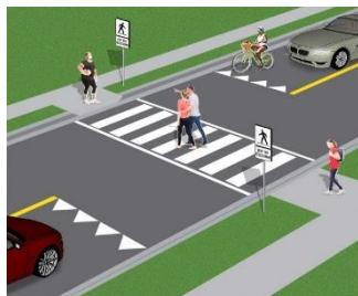
Pedestrian Crossovers (PXO)