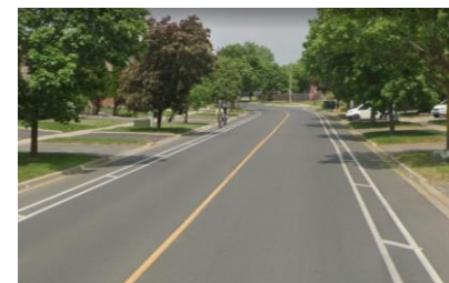
Buffered Urban Shoulders