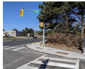
Intersection & Accessibility Improvements