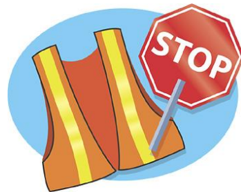
School Crossing Guards