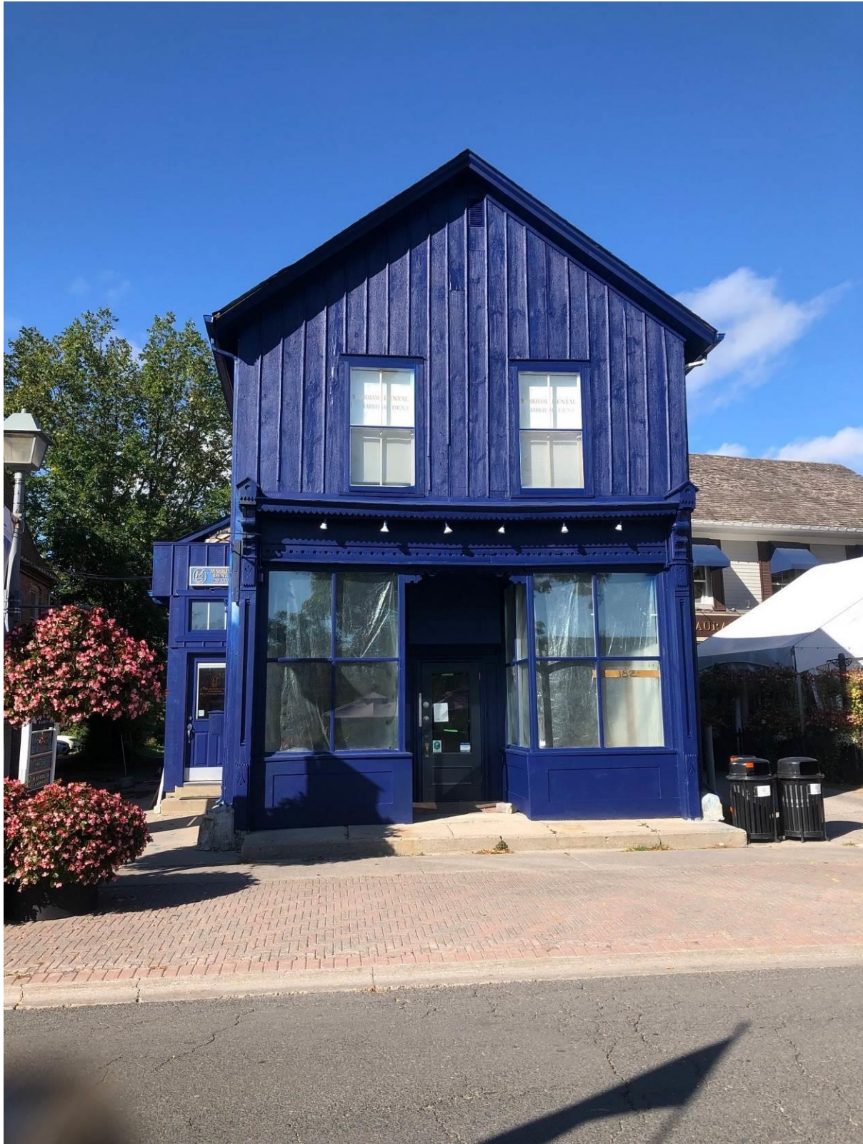
East (primary elevation) of the subject property following repainting