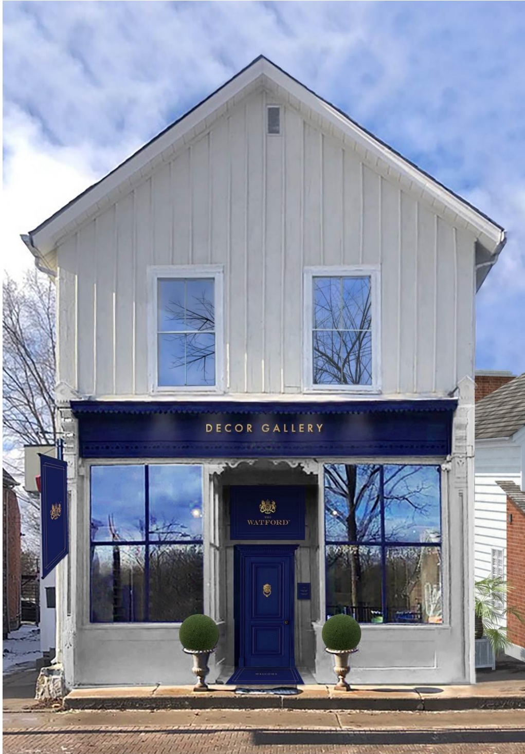
Rendering of the subject property (east elevation) showing the revised paint scheme