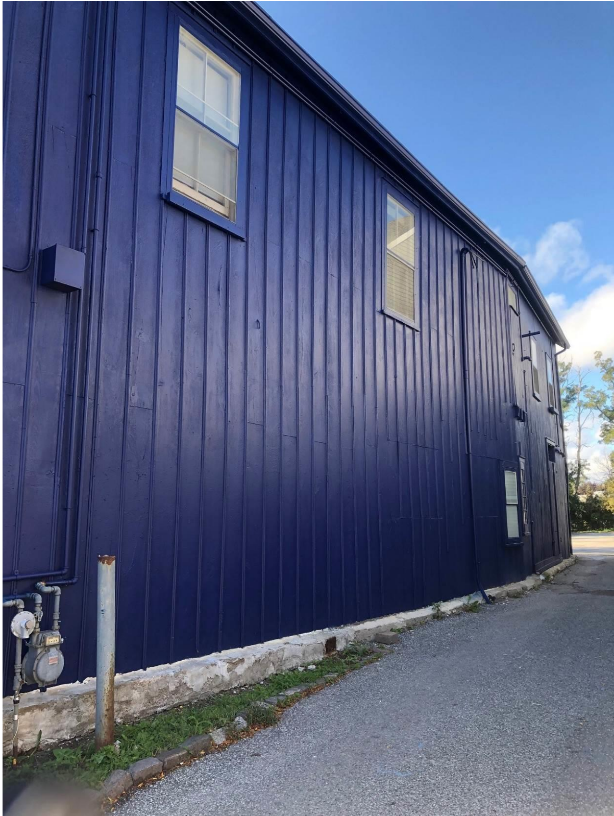
North elevation of the subject property following repainting