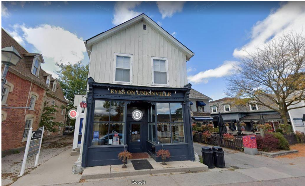
Image of the subject property (east elevation) prior to the recent repainting