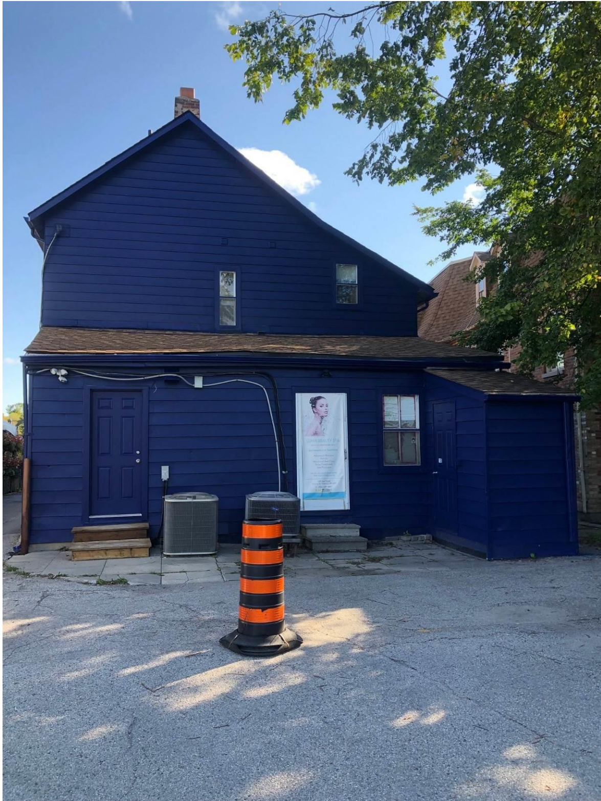
West elevation of the subject property following repainting