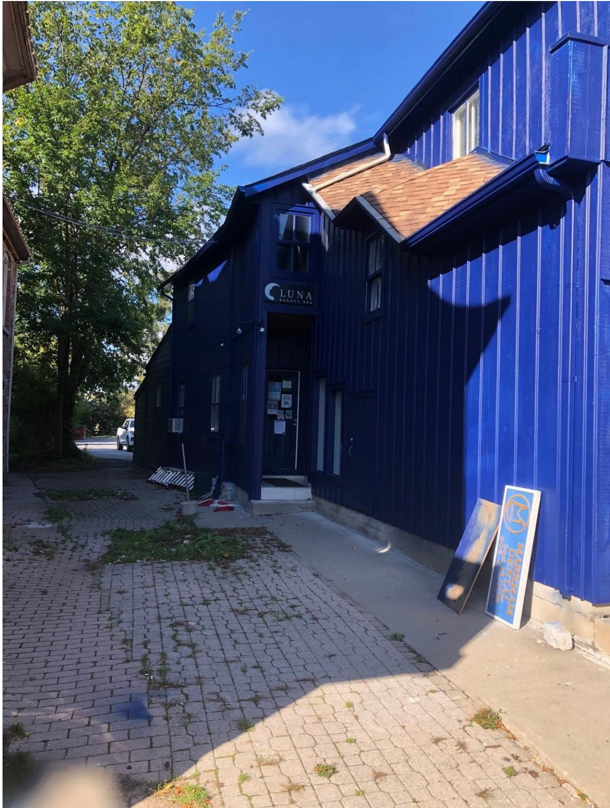
South elevation of the subject property following repainting