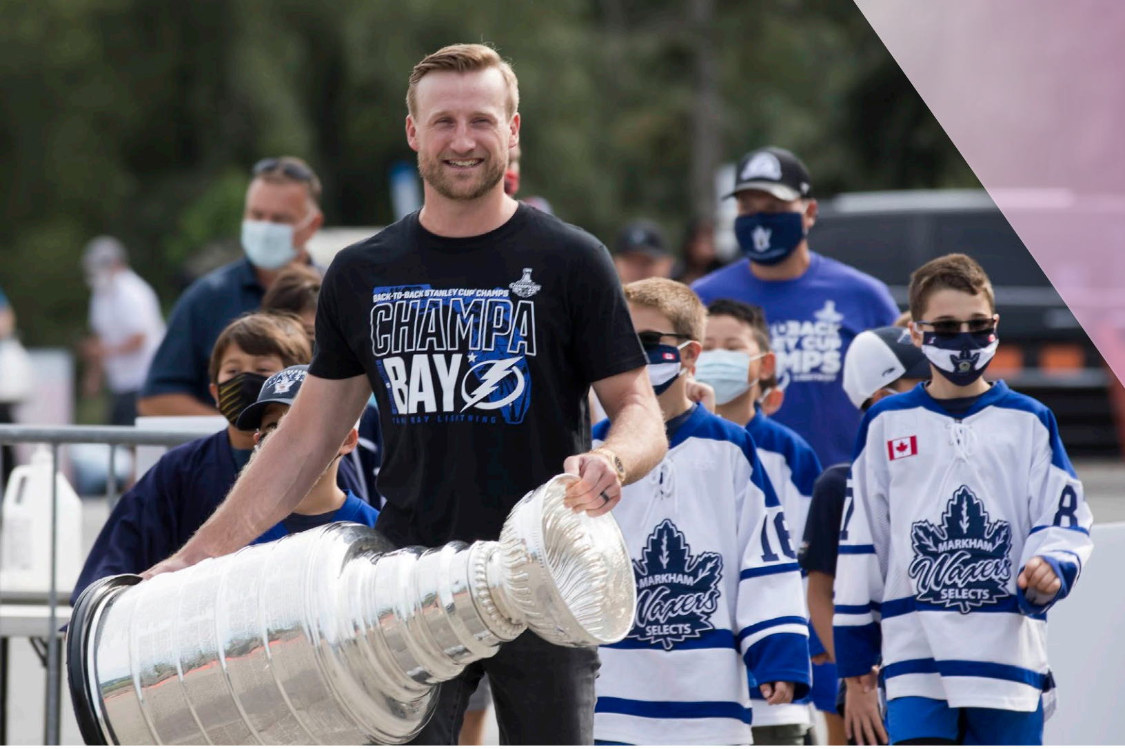
Steven Stamkos brought Stanley Cup to Markham (above). Family skating at Markham Civic Centre outdoor rink (back cover).