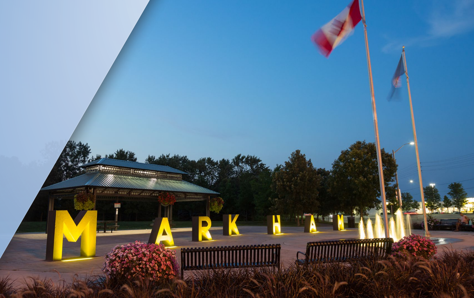
John Daniels Park lit with gold to celebrate Andre De Grasse's golden moment at the Tokyo 2020 Olympic Games.