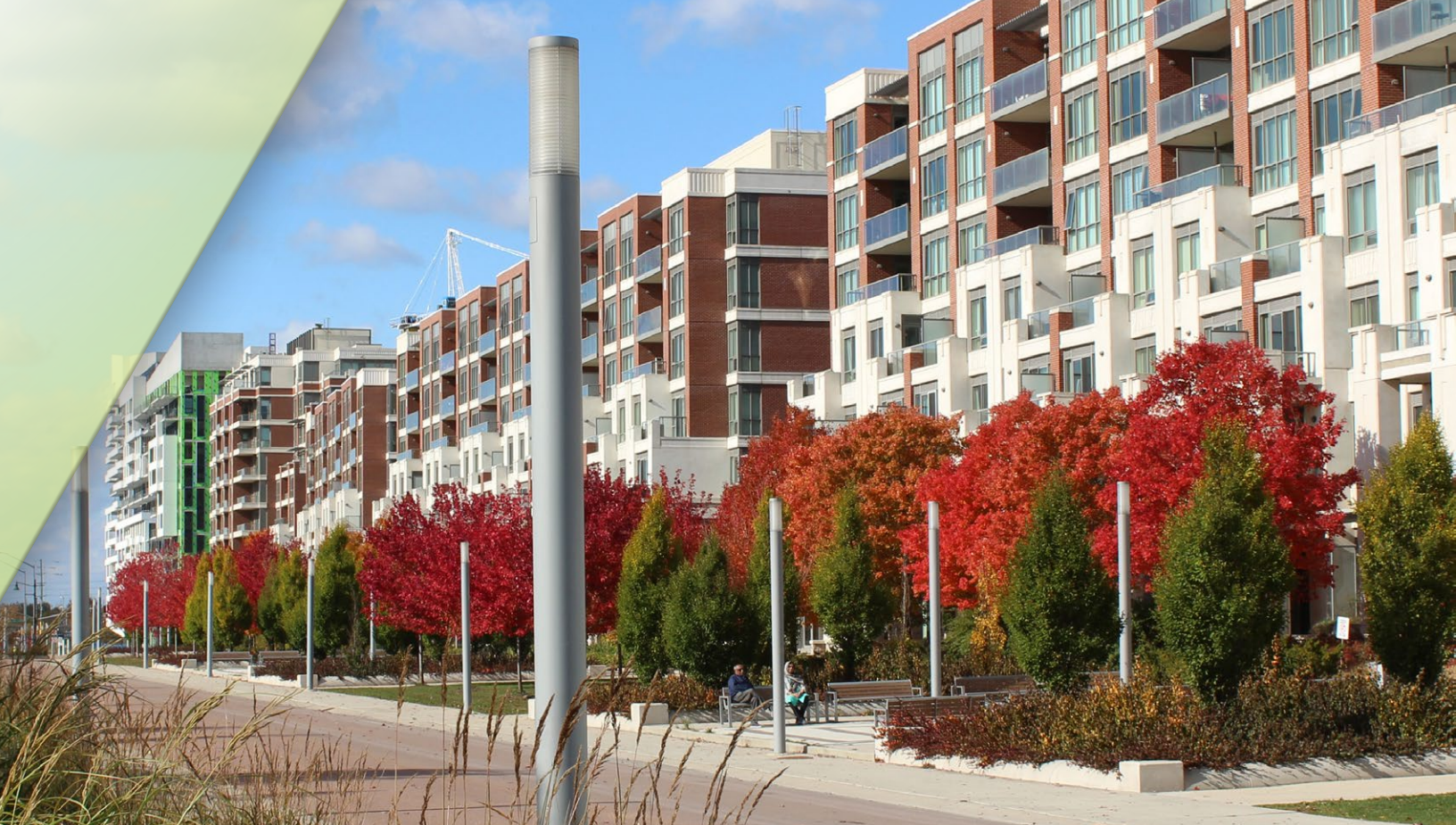
High-density development in Markham Centre.