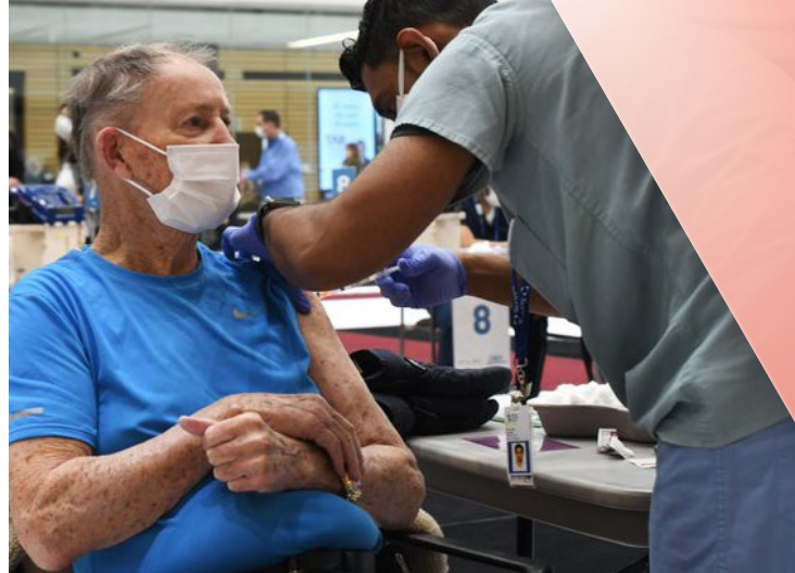
Health care staff posed for a picture at one of the mass vaccination clinics (left). Resident receives vaccination (right).