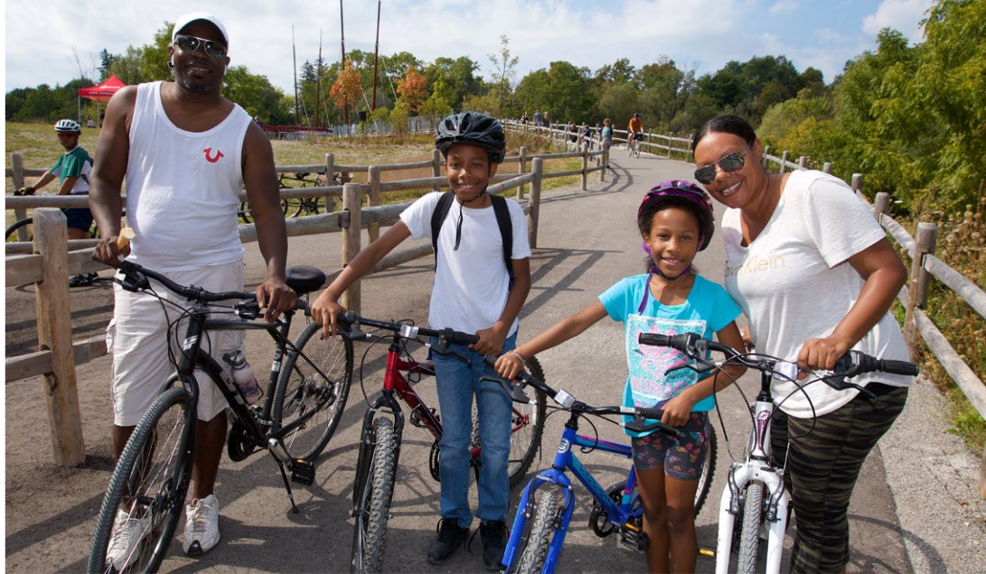
Kids playing at newly opened Harmony Park (left). Markham 50 banners on Main St. Markham (middle). Family enjoying new bike trail (right).