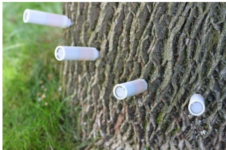
BioForest injection capsules installed into a tree stem. Tree Azin will enter the vascular system, once capsules are empty, they are removed from the tree trunk.