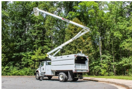
Forestry truck, set up to perform aerial work such as egg mass removals. Giving access to hard to reach locations.