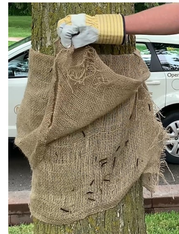
Burlap banding installed on a tree, with an active LDD caterpillar population. Caterpillars will be collected and disposed of in a safe manner.