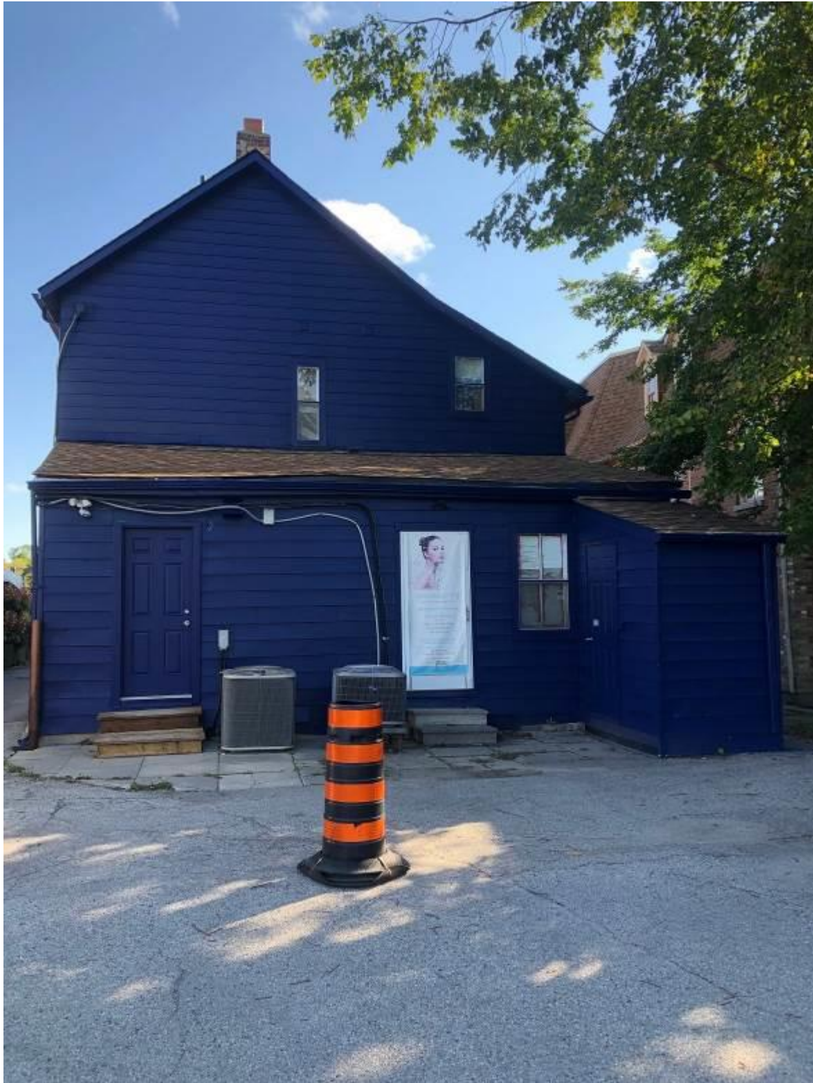
West elevation of the subject property following repainting