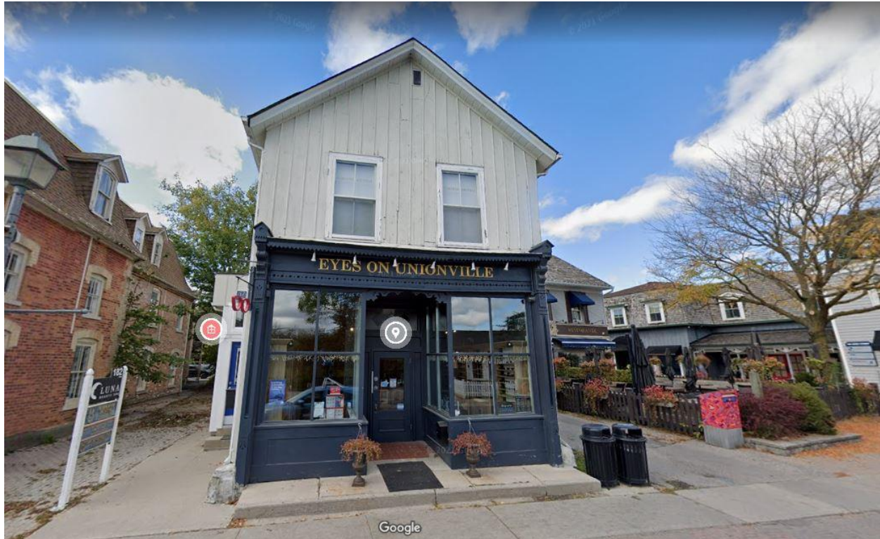
Image of the subject property (east elevation) prior to the recent repainting