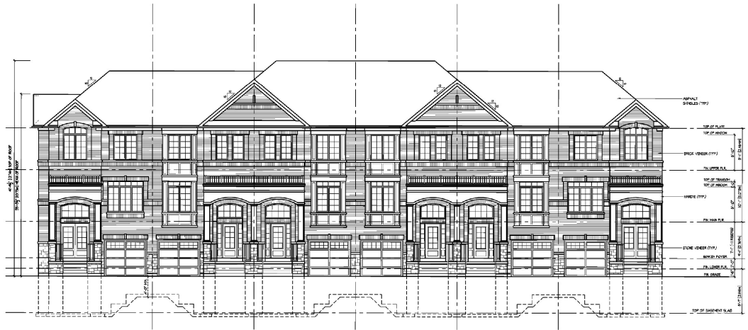
FRONT ELEVATION (TYPICAL 6.0m FRONT LOADED TOWNS)