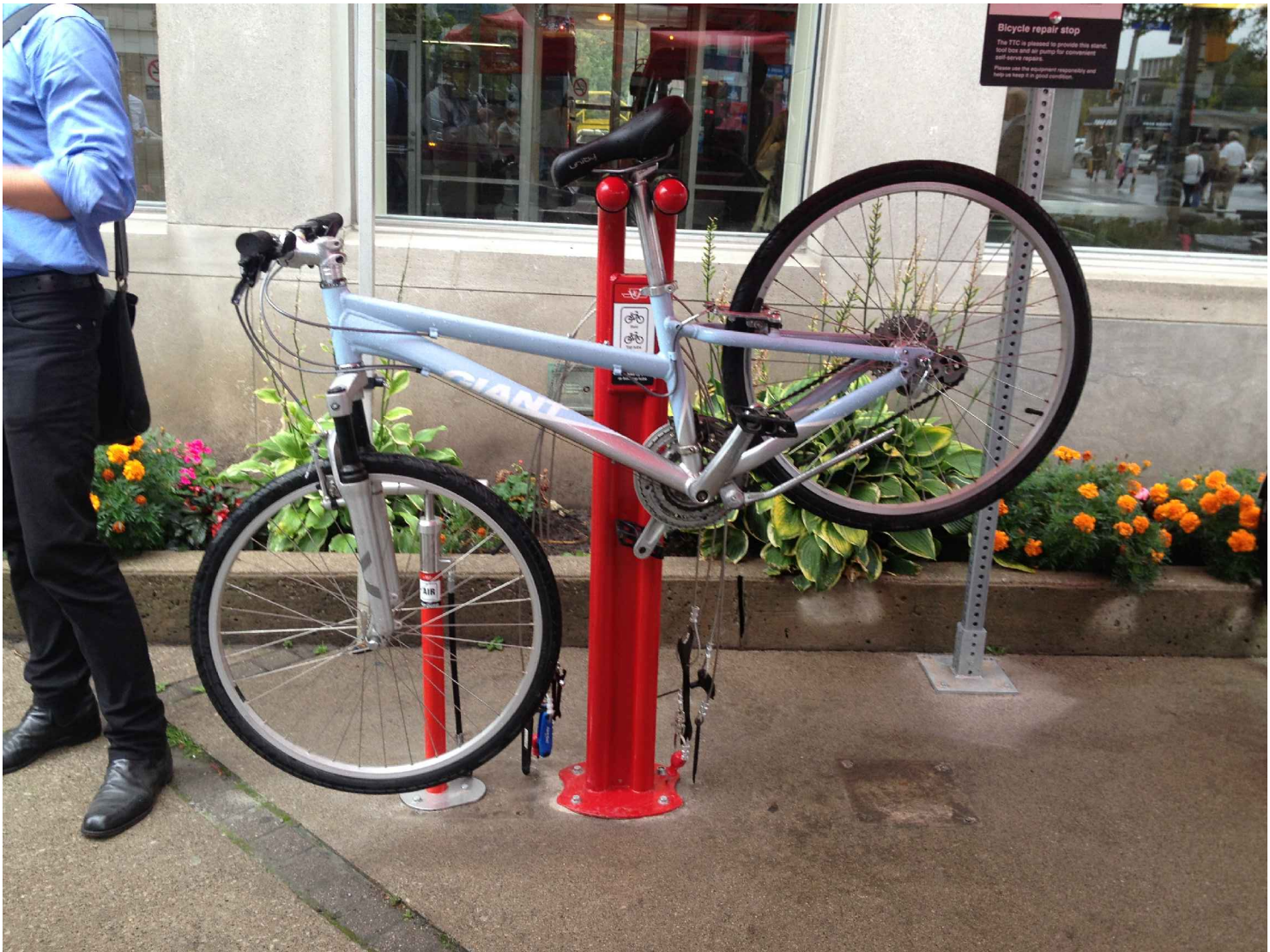
BICYCLE PARKING + REPAIR STATION