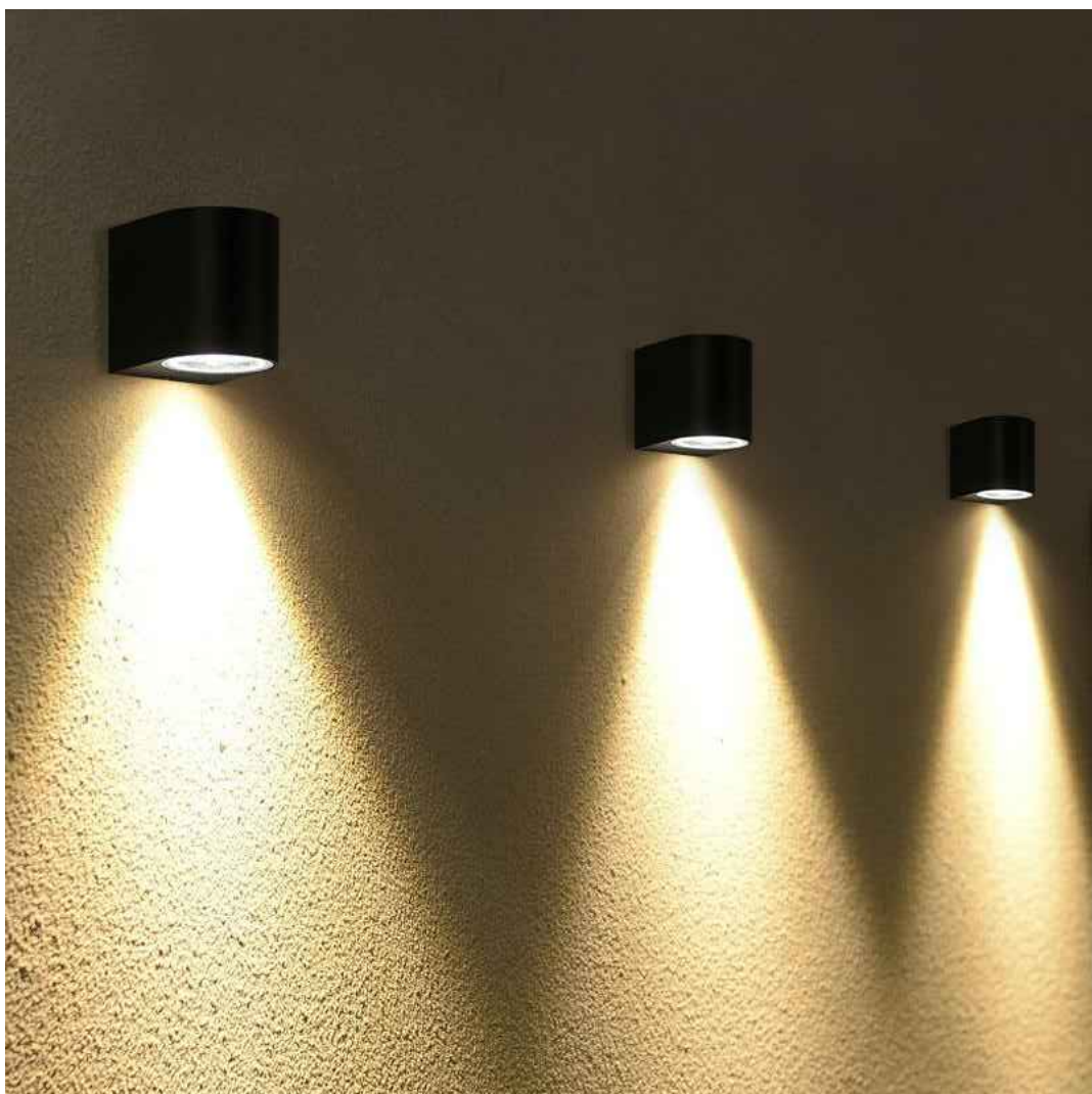
DARK SKY COMPLIANT LIGHT FIXTURES