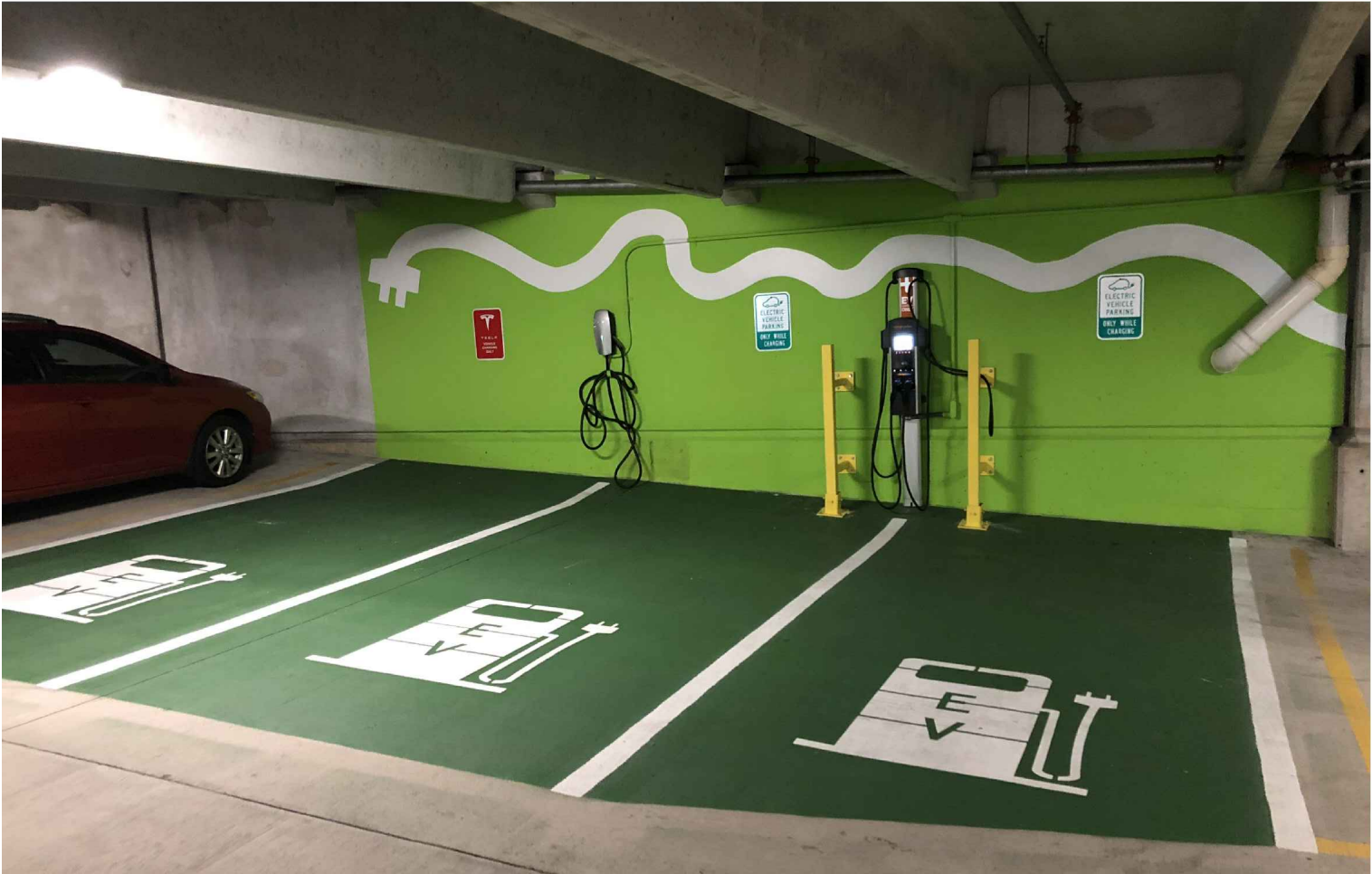
EV PARKING SPACES