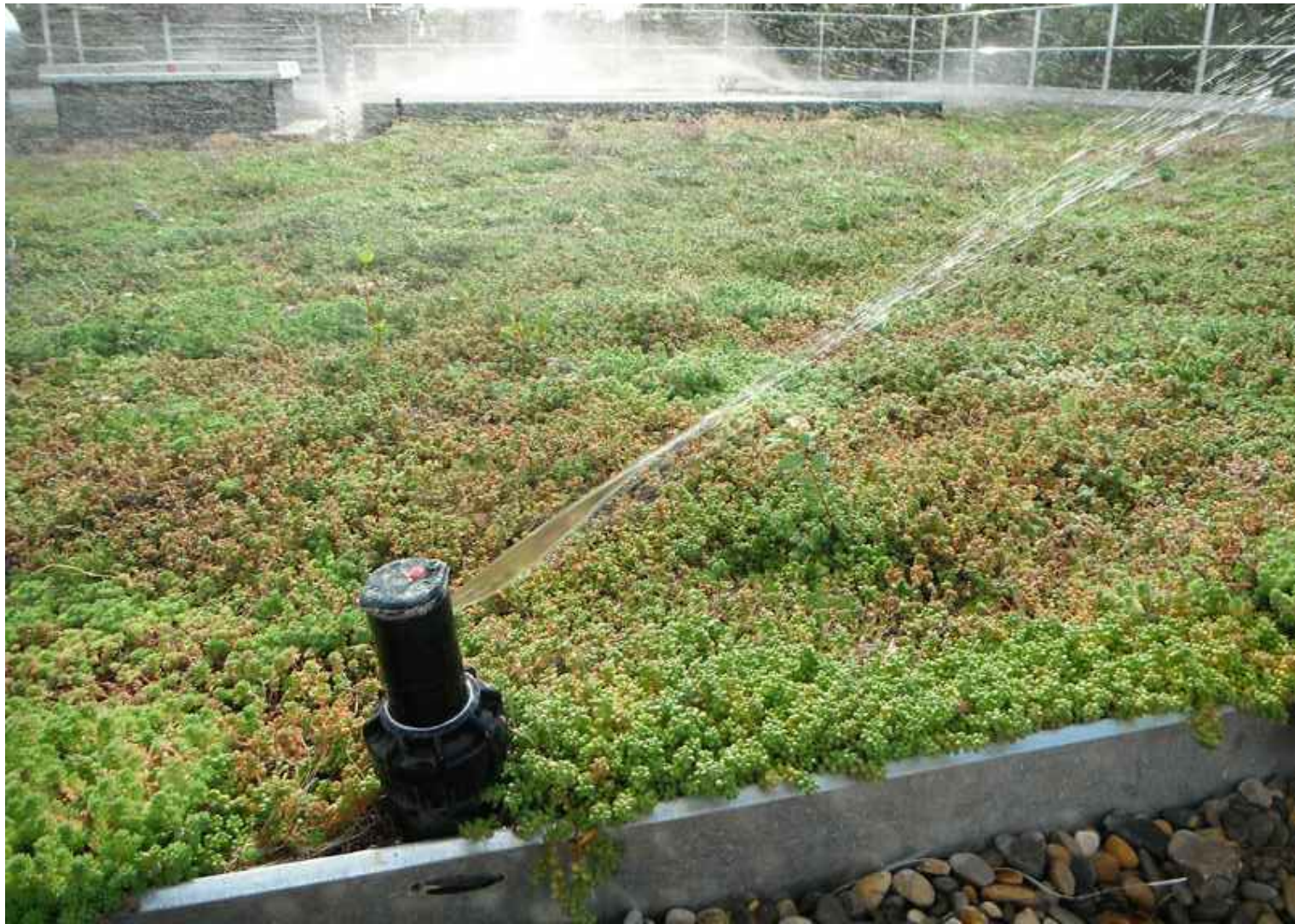
STORM WATER REUSE / IRRIGATION