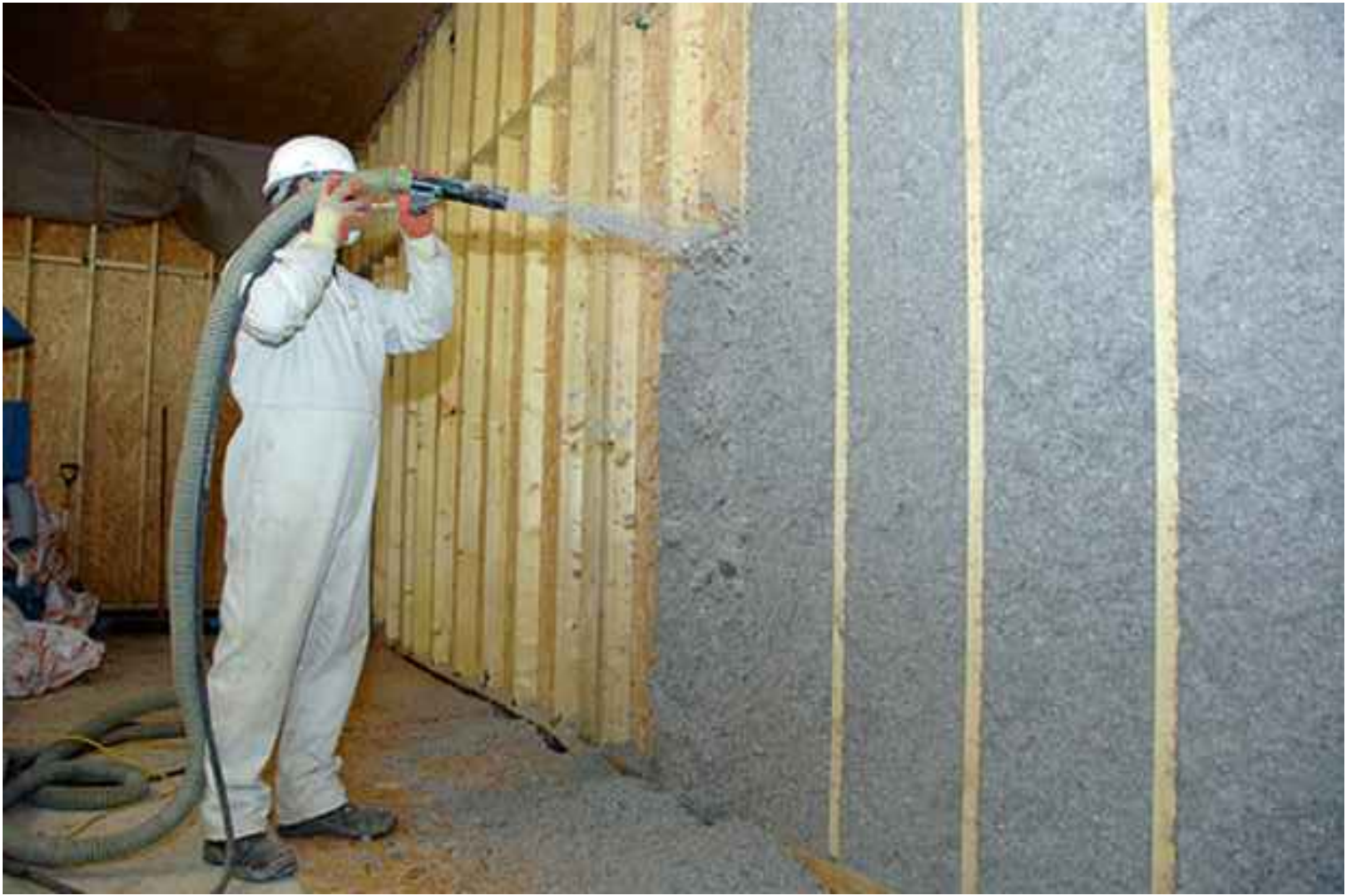
INCREASED THERMAL INSULATION