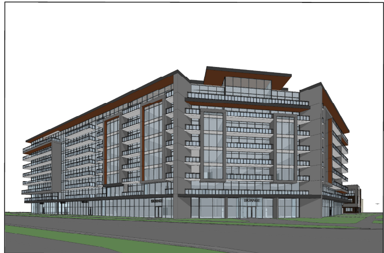
2 VIEW 02 (From Woodbine & Victoria Square Blvd.)