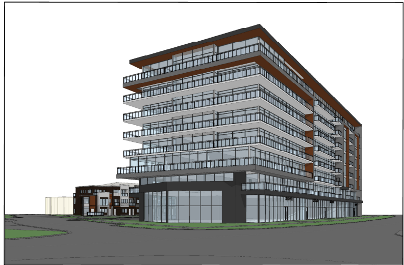
1 VIEW 01 (From Victoria Square Blvd & Vetmar Rd.)