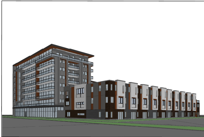
4 VIEW 04 (From Woodbine Ave.-SW)