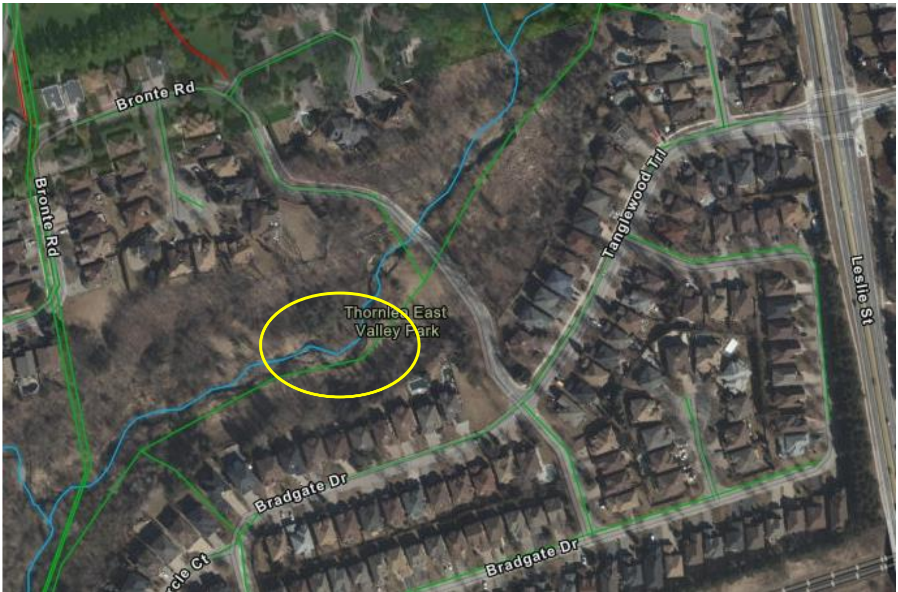
Attachment 'B' – Tributary to German Mills Creek Site Location