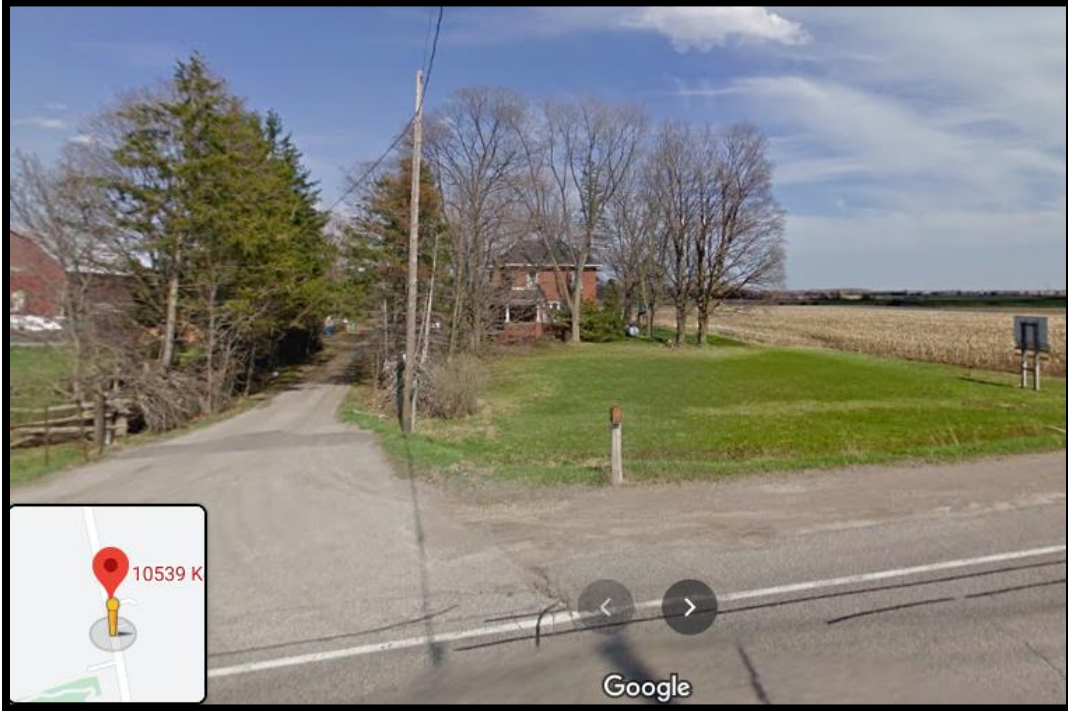
Above: The Arthur Wegg House shown in Google Street View in 2009 Below: City of Markham Photo c.2014