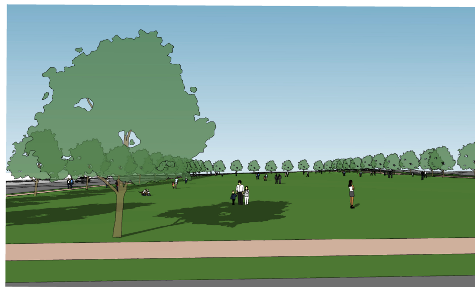
FULL PARK OPTION (PROPOSED)