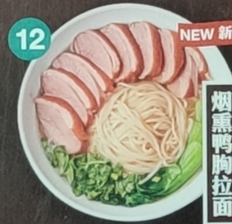
Smoky Duck 10 99

Chicken & Pork Stock / Shrimp & Pork Wonton / Bok Choy / Cilantro / Scallions