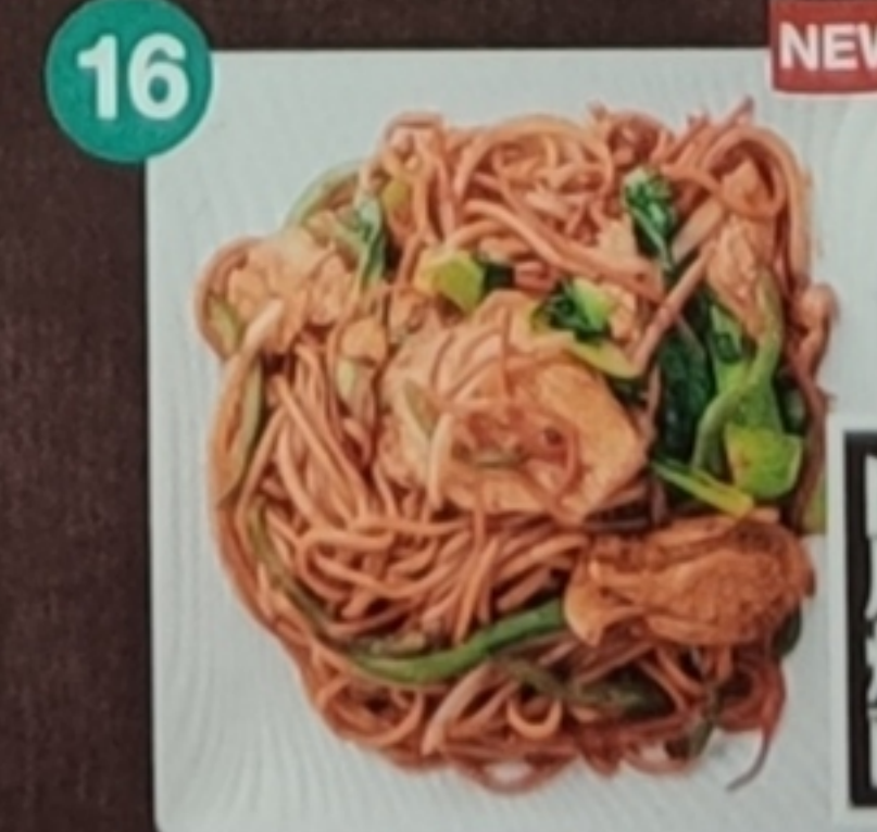
Szechuan Friar 12 99

Lamb / Tomato / Onions / Green Pepper / Celery