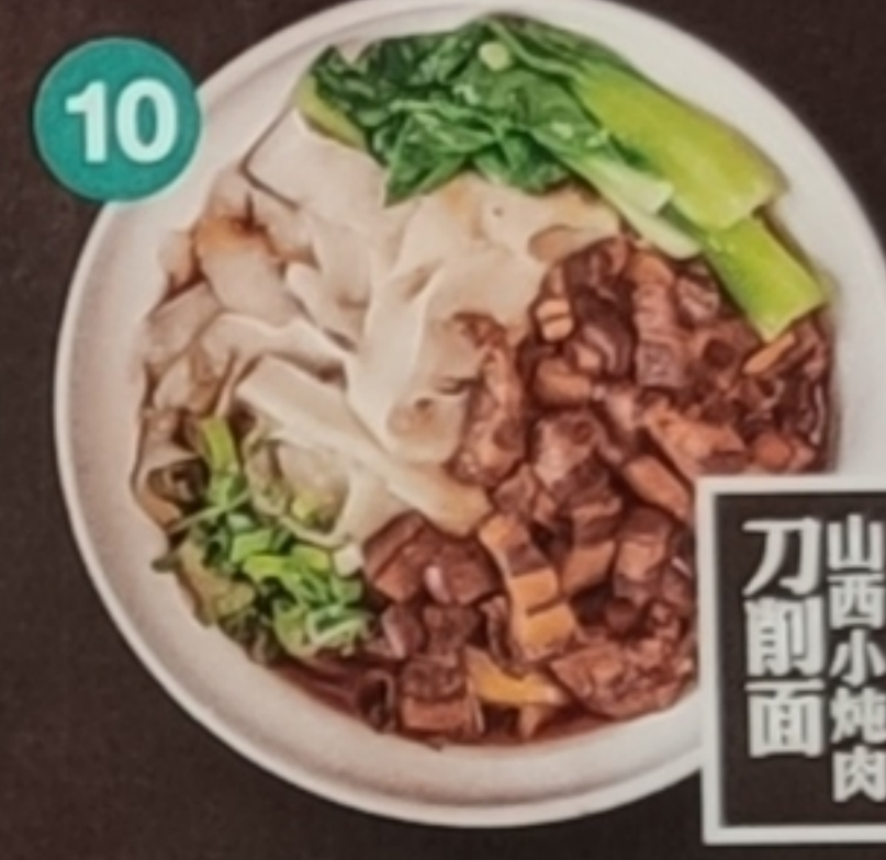
Pot Belly 10 59

Vegetable Stock / Broccoli / Cauliflower / Carrots / Fried Egg / Shiitake Mushrooms / Bok Choy