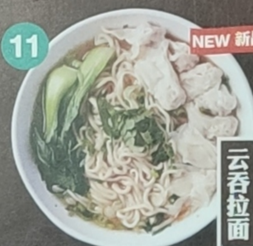
Shrimp & Pork Wonton 9 99

Braised Pork Belly / Bok Choy / Scallions