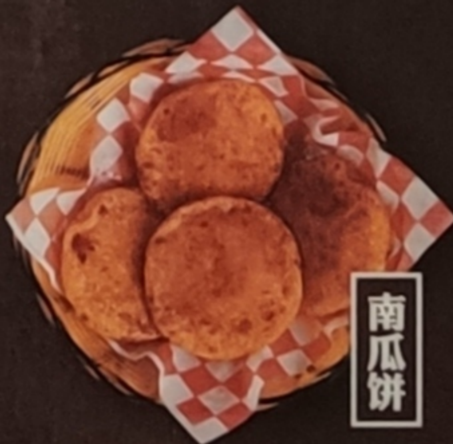
Pumpkin Cake 3 99 Red Bean