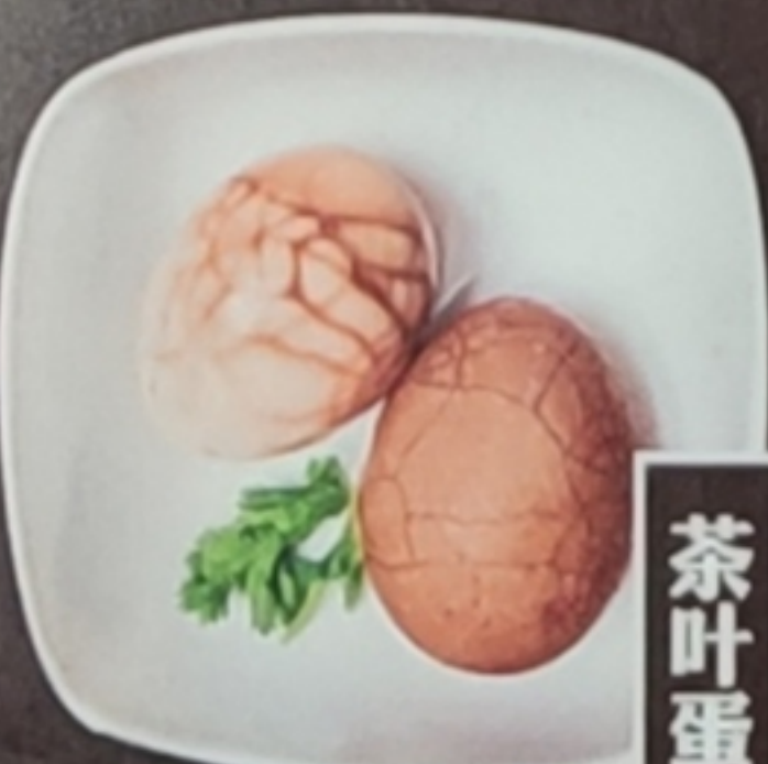
Tea Egg 1 50 / ea