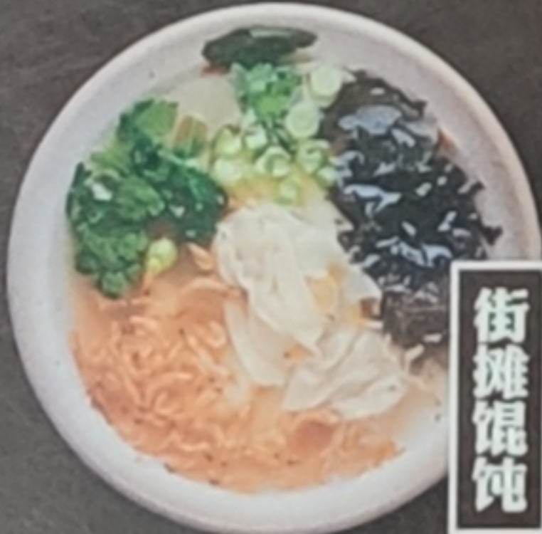
Magic Wonton 4 99 Shrimp & Pork Wonton / Seaweed / Dried Shrimps / Pickled Vegetables / Cilantro / Scallions