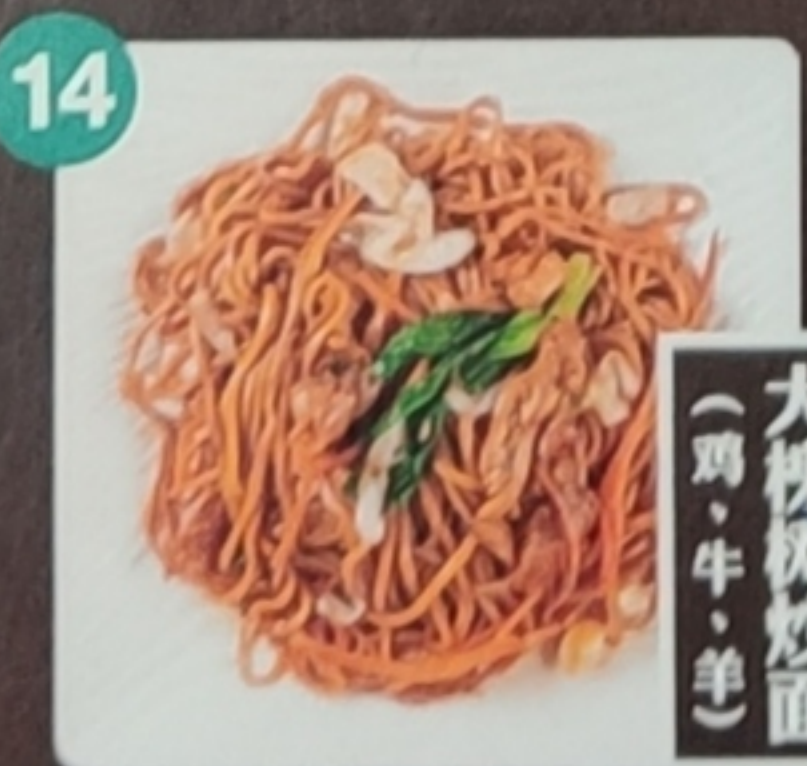
Signature Friar 11 99 (Chicken, Beef or Lamb)