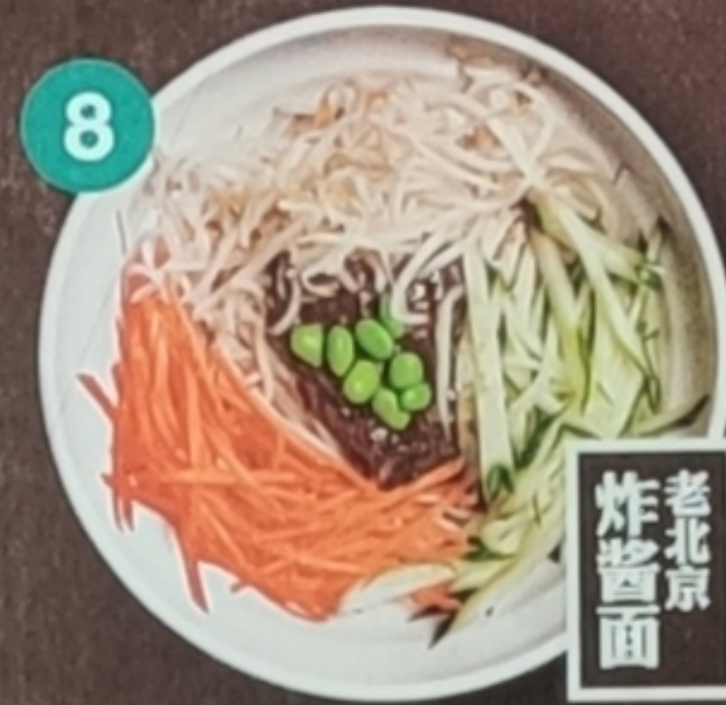
Beijing Bang 9 99

Chicken & Pork Stock / Shiitake Mushroom / Pan-Fried Chicken Fillet / Bok Choy / Cilantro / Scallions