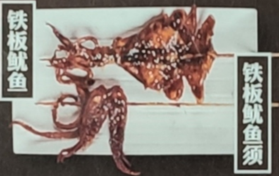
Sizzling Fresh Squid Sizzling Tentacle 4 59 🌶️🌶️ 2 79 🌶️🌶️