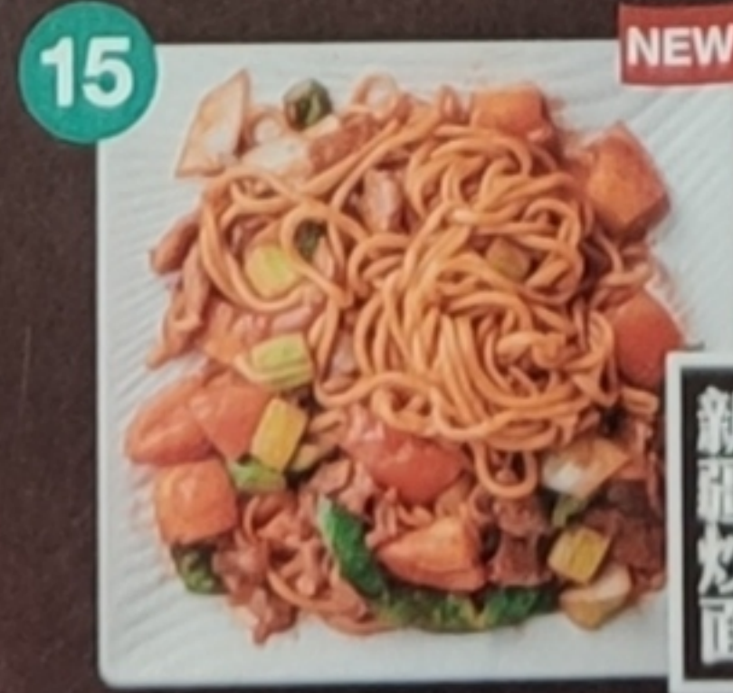
Xinjiang Friar 12 99

Lamb / Tomato / Onions / Green Pepper / Celery