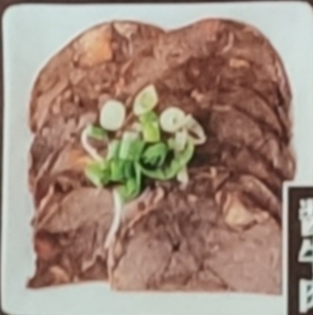
Skinny Cow 6 99 Sliced Beef / Savory Soy Sauce / Scallion