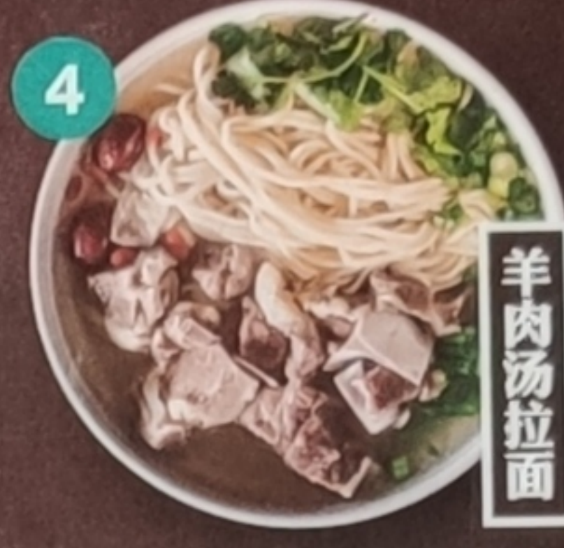
Magic Lamb 10 59

Beef Stock / Braised Beef Brisket / Pickled Turnip / Cilantro / Scallions