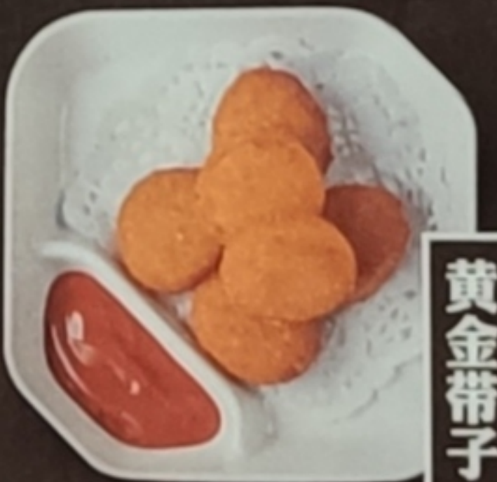
Golden Scallop 5 59 Fried Scallop / Thousand Island Sauce