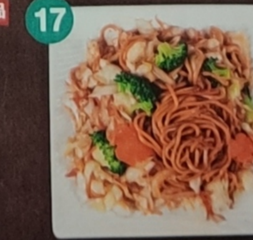
Veggie Friar 11 99

Chicken / Onions / Green Pepper / Carrot / Bok Choy