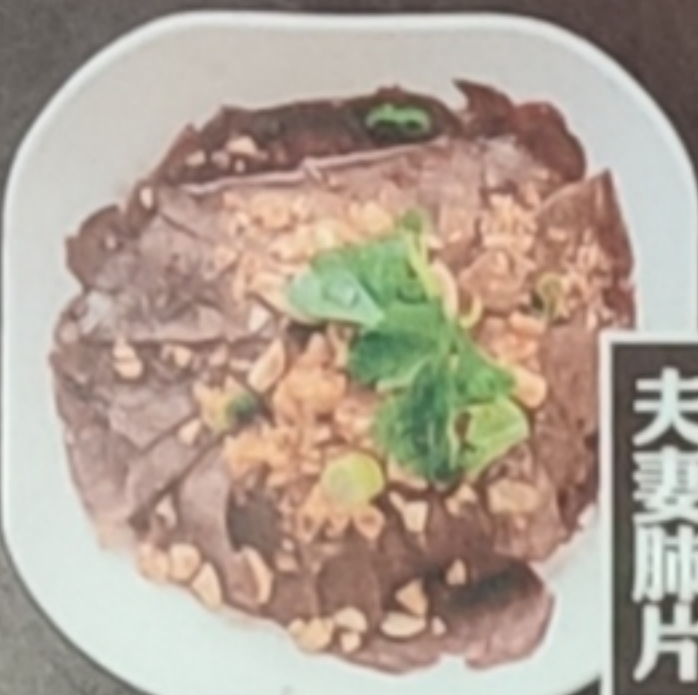
Spiced-up Marriage 7 99 Sliced Beef - Tripe & Lung / Spicy Garlic Soy Sauce / Cilantro / Scallion