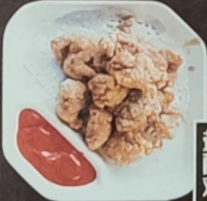
Popcorn Chicken 5 59 Boneless Chicken Thousand Island Dressing