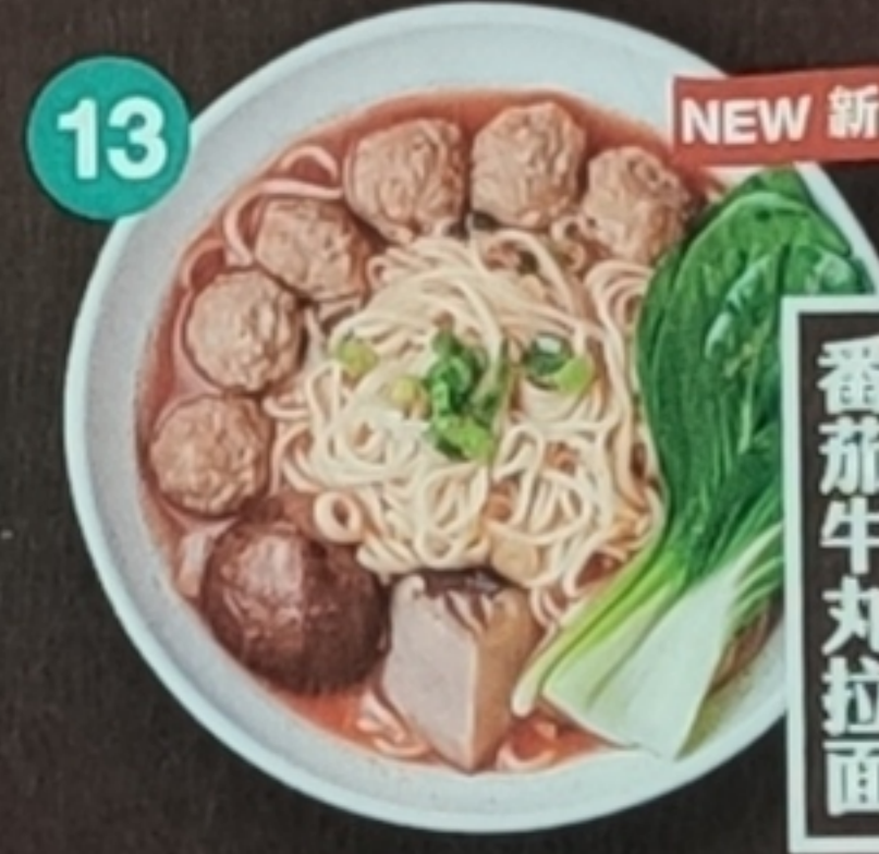
Tomato Beef 10 99

Chicken & Pork Stock / Smoked Duck Breast / Bok Choy / Scallions / Cilantro