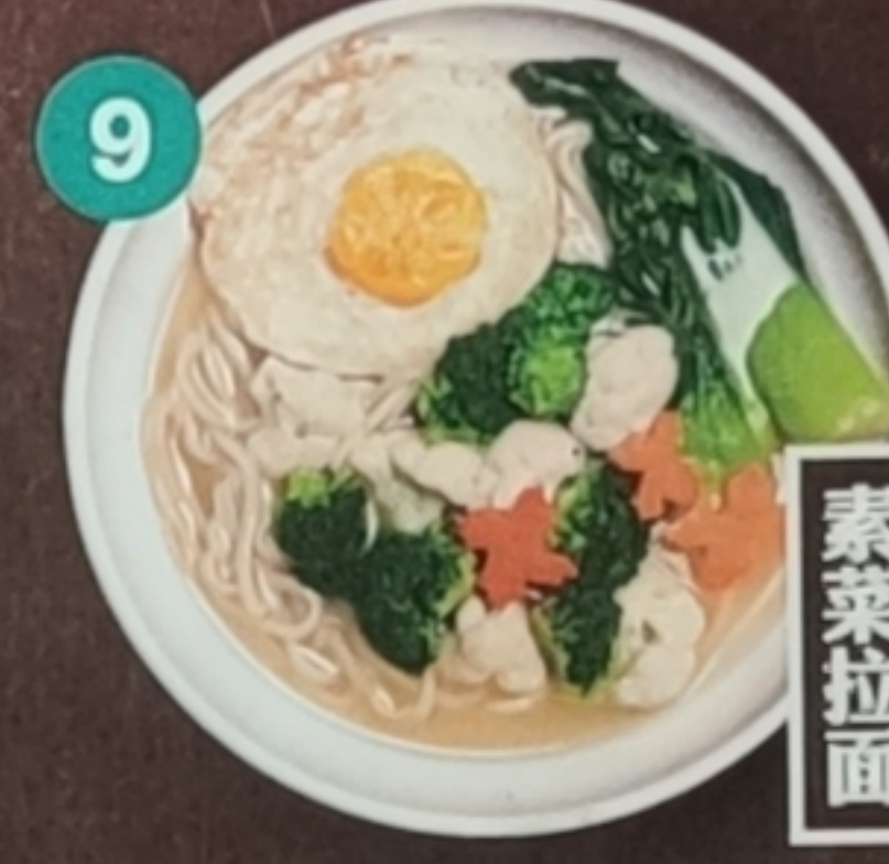
Tree Hugger 9 99

Black Bean Sauce w/ Minced Pork / Sliced Cucumbers / Sliced Carrots / Bean Sprouts / Edamame Bean