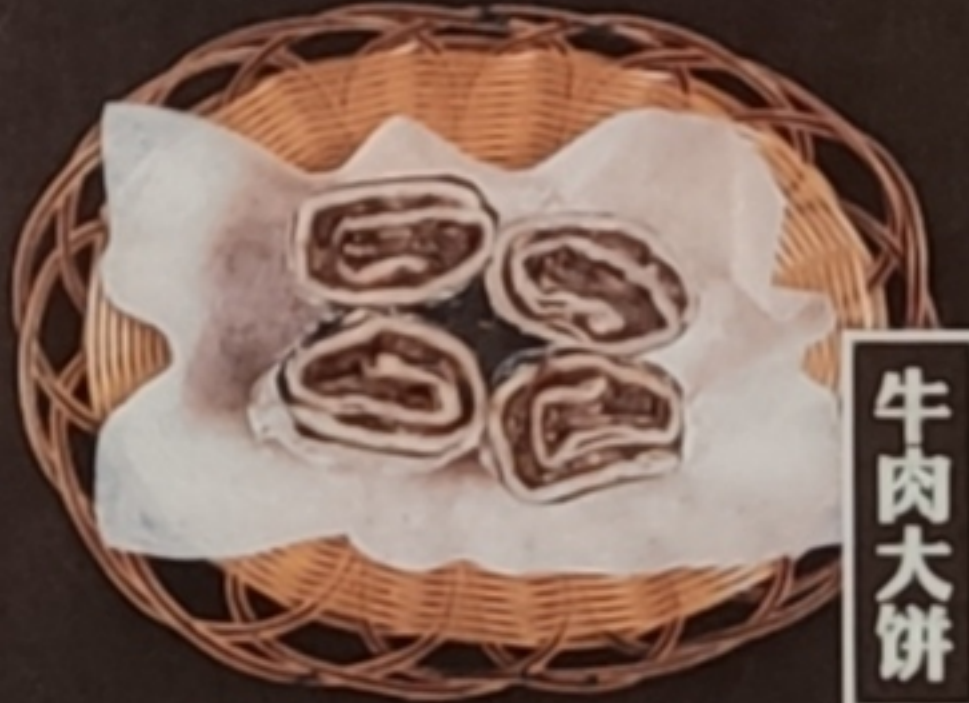
Magic Scrolls 6 59 Flatbread / Sliced Beef Hoisin Sauce / Lettuce