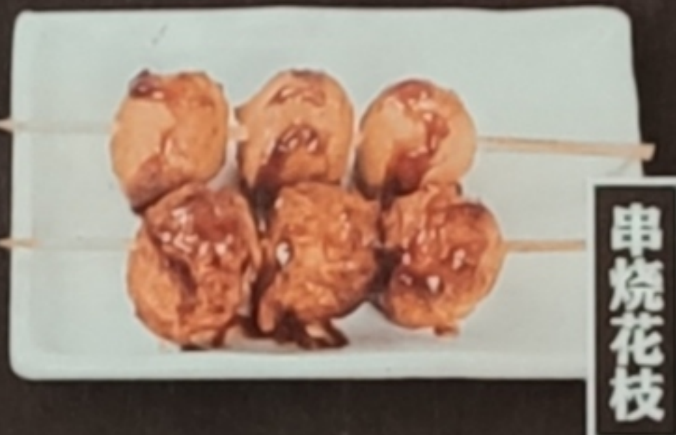
Fried Cuttlefish Balls 2 99 / ea 🌶️