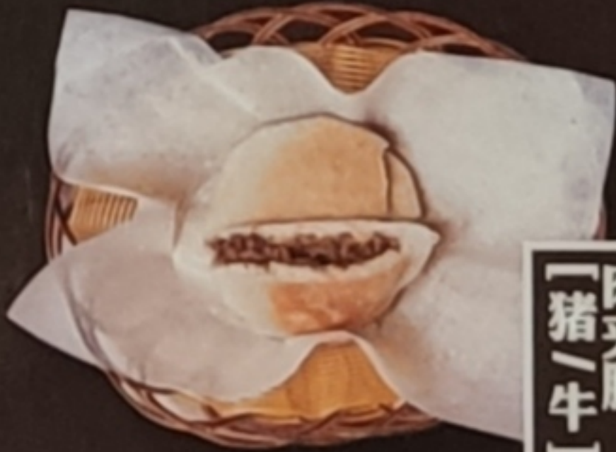
Pork Gamo Beef Gamo 3 99 3 99 Pan-Fried Bao / Cilantro Shredded Pork[Beef] / Cilantro