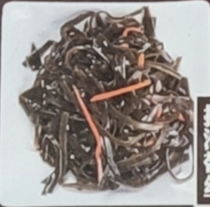
Seaweed Salad 4 99 Sliced Seaweed / Chilli Sesame Oil / Carrots

🌶️ Spicy 🥜 Peanut 🌿 Sesame 🥬 Veggie Lovers