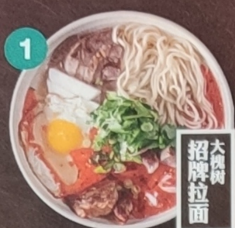
The Magic 10 99

🔥 Spicy 🥜 Peanut 🌱 Sesame 🌿 Veggie Lovers