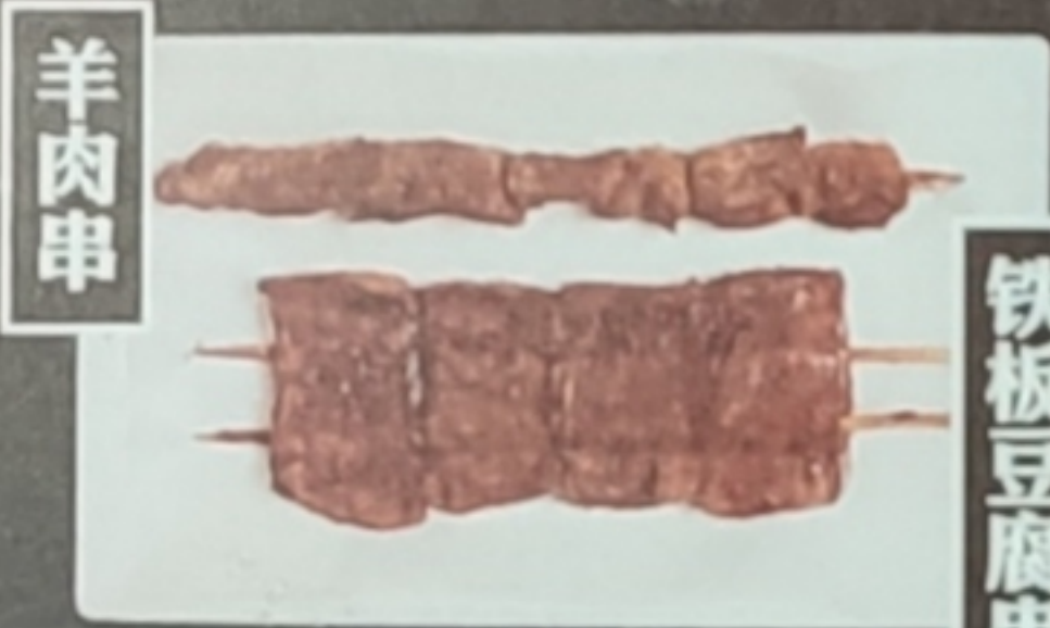
Yang Kebab Tofu Manchu 2 79 🌶️ 2 69 🌶️ Lamb[Fried Tofu] / Cumin Chilli Powder / Hoisin Sauce