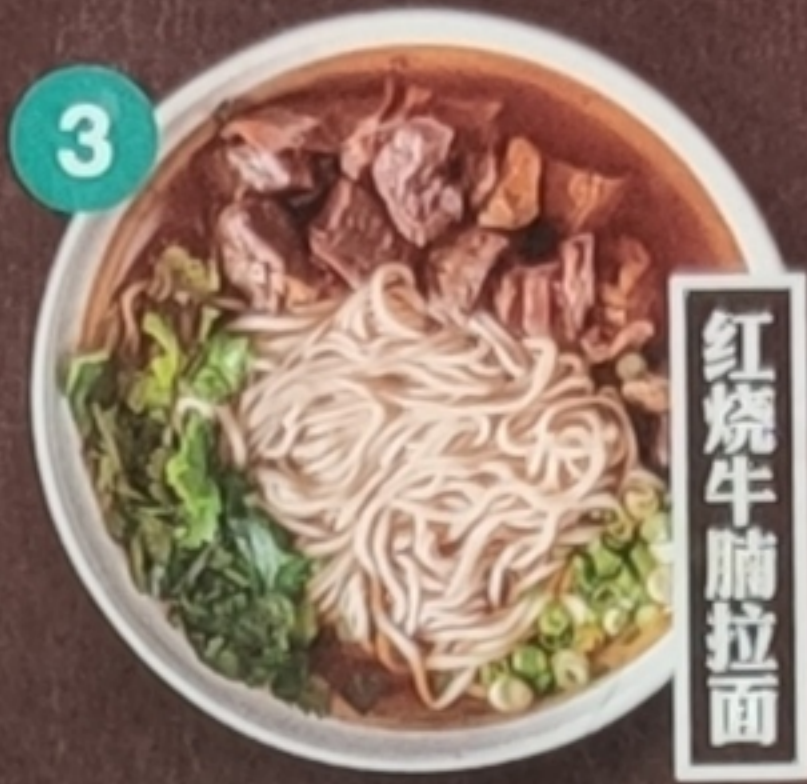
Triple B 10 59

Beef Stock / Sliced Beef / Pickled Turnip / Cilantro / Scallions