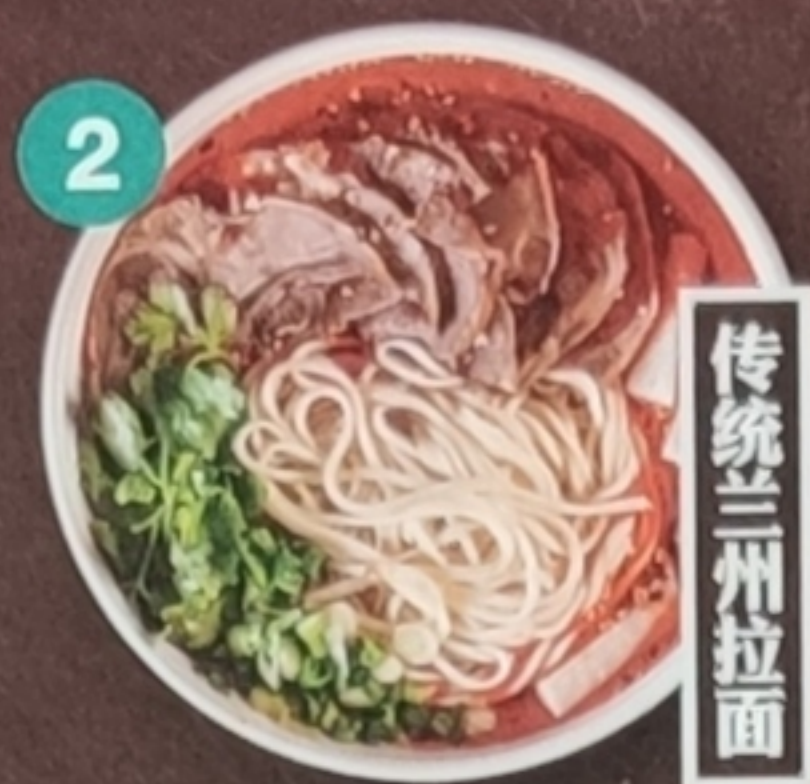
Magic Beef 9 99

Beef Stock / Sliced Beef / Chicken Chop / Fried Egg / Braised Lamb / Beef Tripe / Pickled Turnip / Cilantro / Scallions