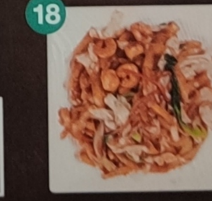
Seafood Friar 13 49

Broccoli / Cauliflower / Onions / Cabbage / Bok Choy / Carrots