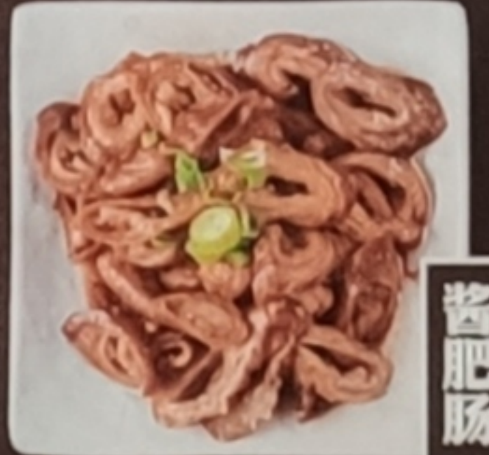
G.I.Ju 6 99 Pig Intestines/ Savory Soy Sauce / Scallion