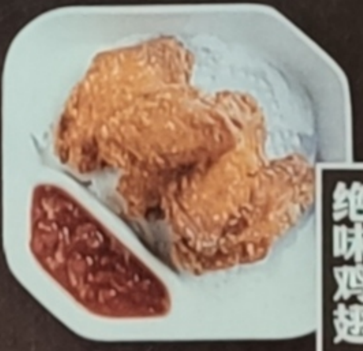
Garlic Fried Wings 6 99 Fried Chicken Wing / Yummy Chilli Sauce