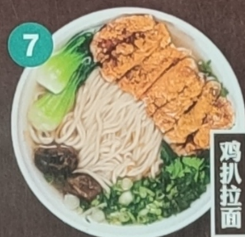
Magic Chicken 10 59

Chicken & Pork Stock / Spicy Pig Intestines / Pickled Turnip / Cilantro / Scallions