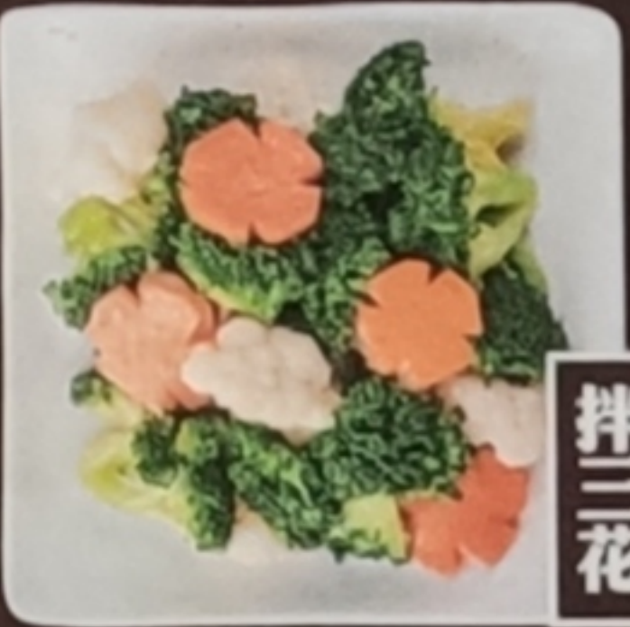
Trinity 4 99 Broccoli / Carrots Cauliflower