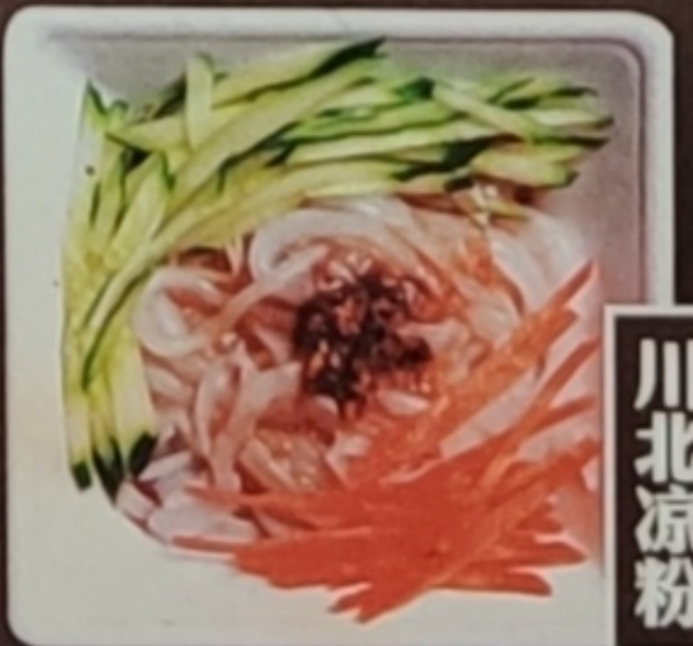
Juli Jelly 4 99 Thin Jelly Noodles / Cucumbers / Carrots / Soy Vinaigrette / Sesame Oil / Chilli Oil