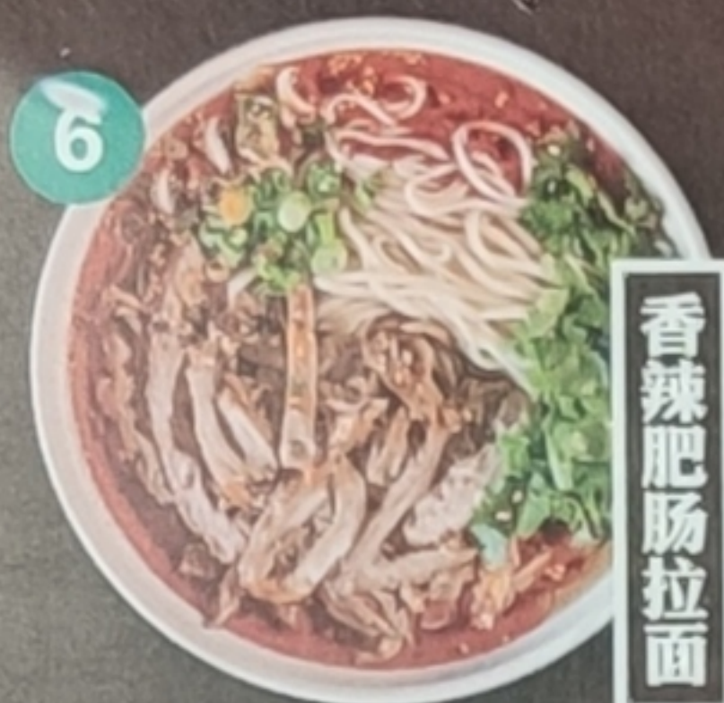
G.I.Ju 10 59

Chicken & Pork Stock / Spicy Pig Intestines / Pickled Turnip / Cilantro / Scallions