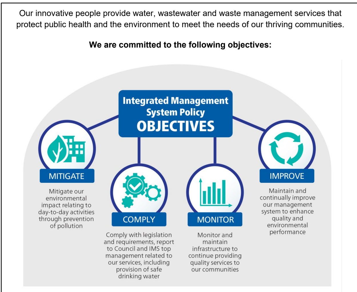
Figure 1 Integrated Management System Policy