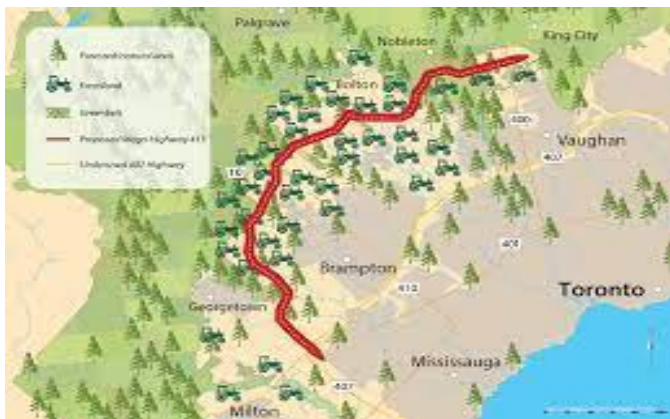
Figure 1 - Proposed 413 Highway Route