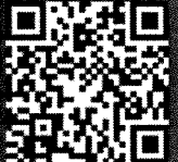
TABLE NO. _____ *訂位電話: 905.604.3188 訂位數: 0000 *Please confirm to our staff about your food orders. Thank you!