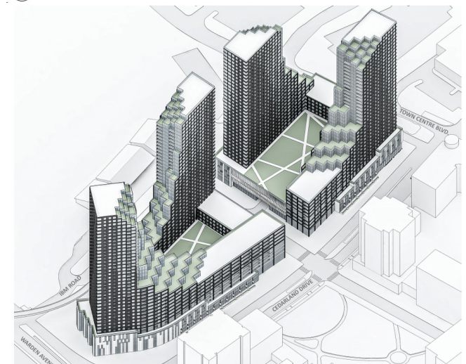
1 AERIAL VIEW LOOKING SOUTHWEST A001 PERSPECTIVE