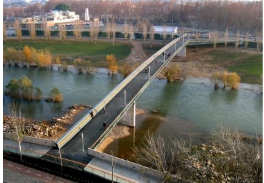
Segre River Bridge, Spain