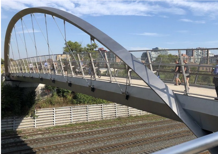
Garrison Point Bridge, Toronto