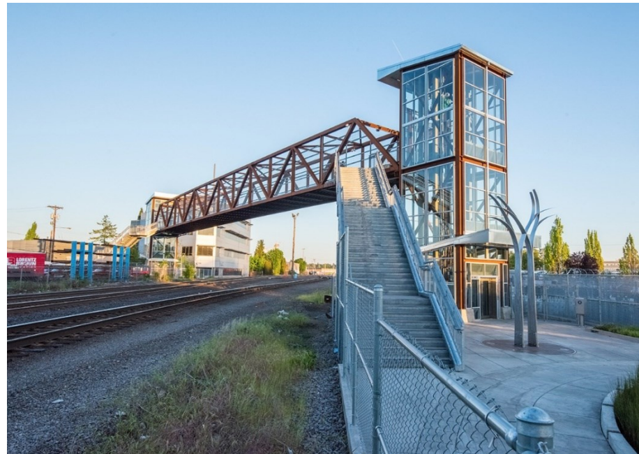
Rhine-Lafayette Pedestrian Bridge, Oregon