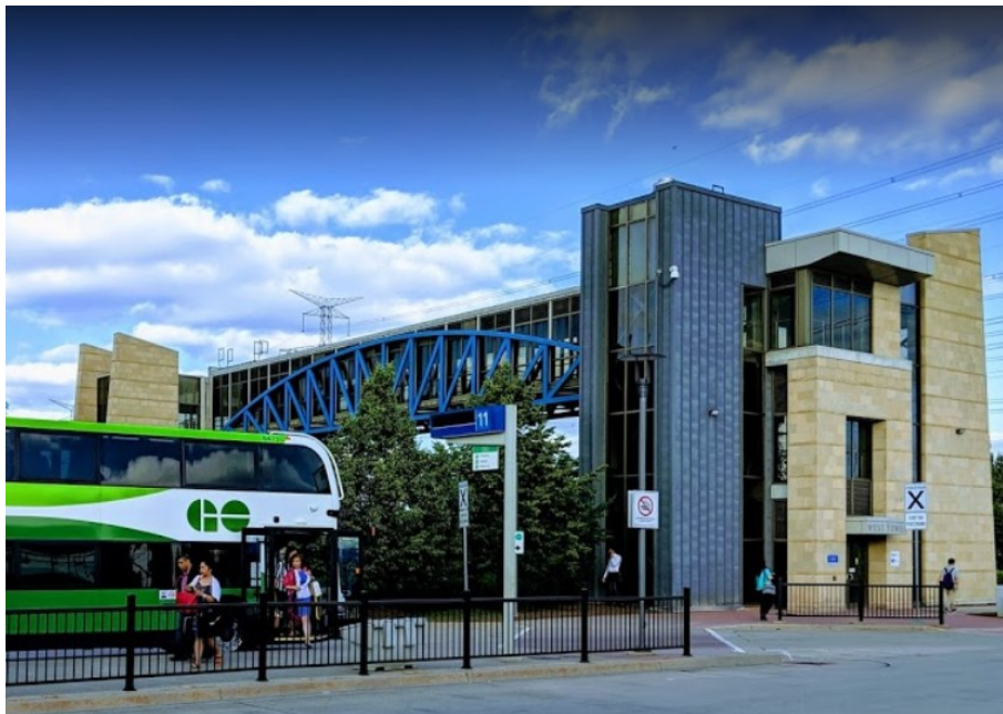
Richmond Hill Centre Pedestrian Bridge