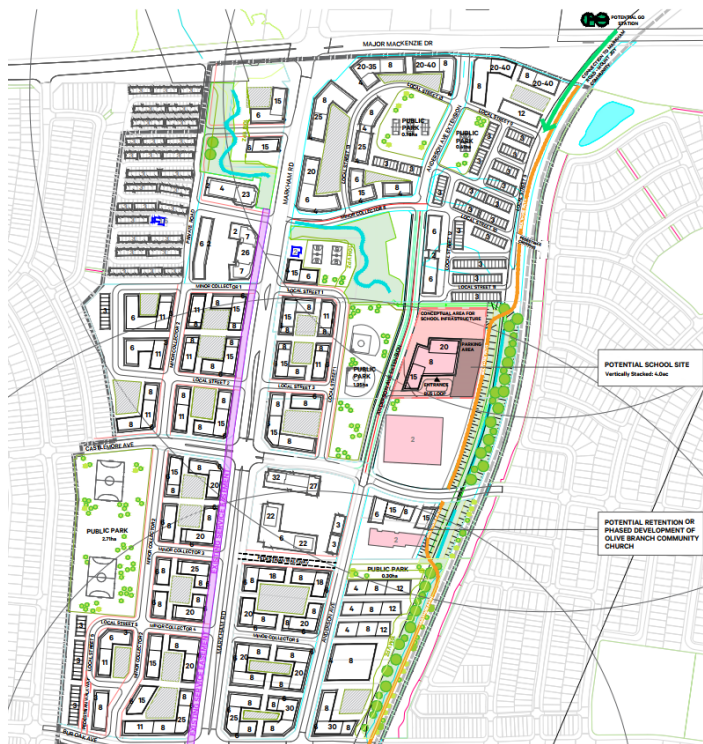
Major Mackenzie Drive to Bur Oak Avenue