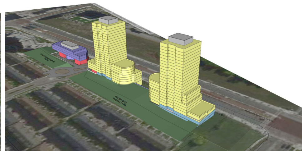
VIEW LOOKING SOUTH-EAST FROM TOWARDS HWY 7