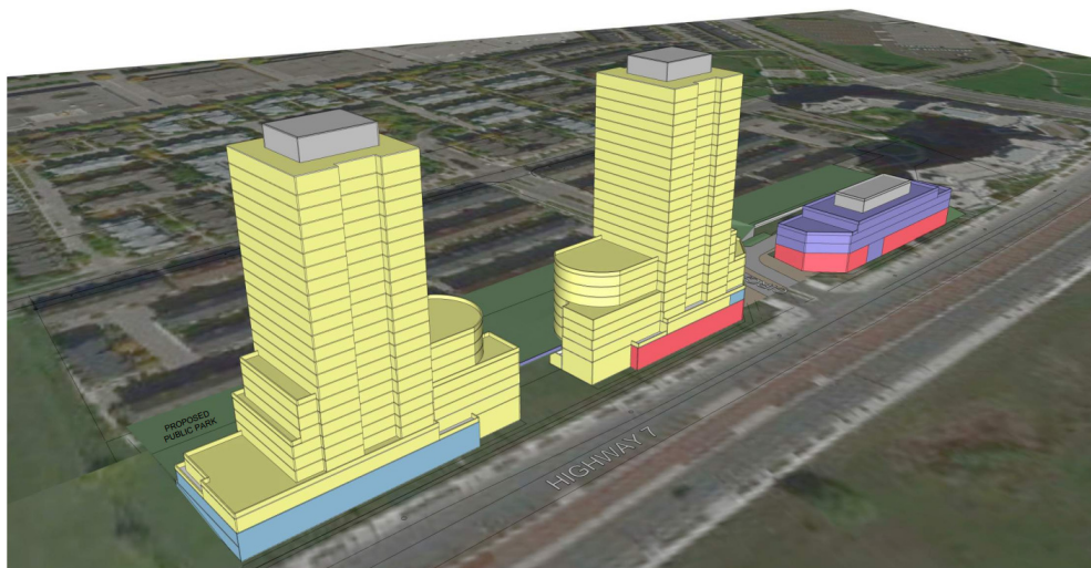
VIEW LOOKING NORTH-EAST FROM HWY 7