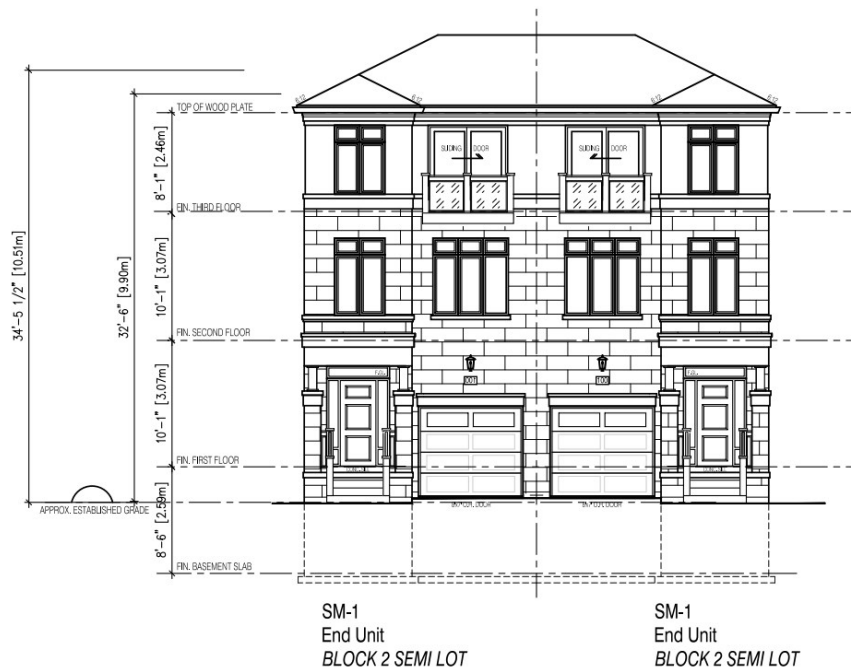
BLOCK 2 SEMI FRONT ELEVATION