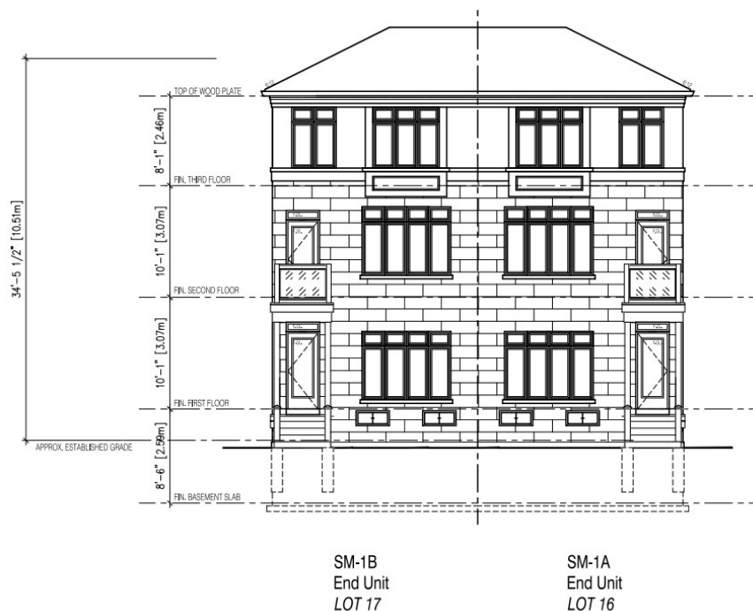
BLOCK 2 REAR ELEVATION