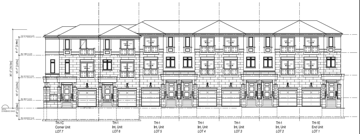
PRIVATE LANE ELEVATION