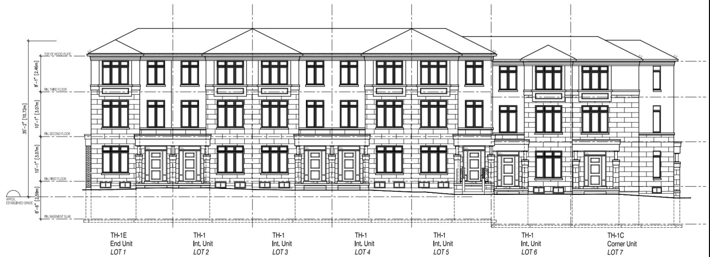
BLOCK 1 SIXTEENTH AVENUE ELEVATION