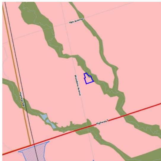
YORK REGION OFFICIAL PLAN MAP 1 - REGIONAL STRUCTURE

Subject Lands Urban Area Protected Countryside Parkway West Belt Plan Regional Corridor