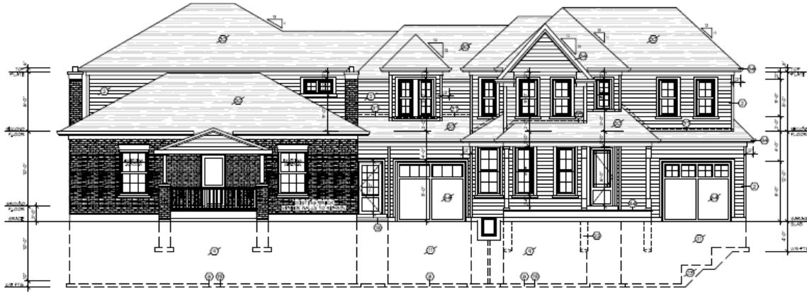
FRONT (WEST) ELEVATION