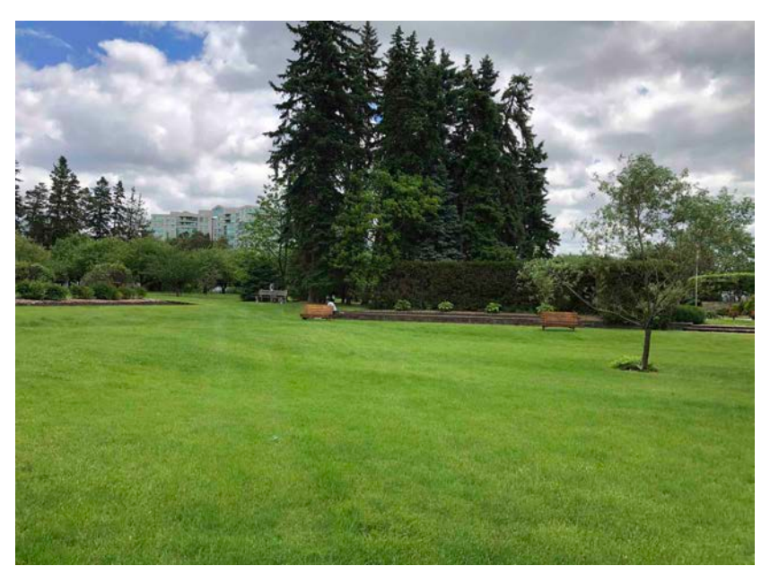
Plate 12 Shows conditions for test pit survey.