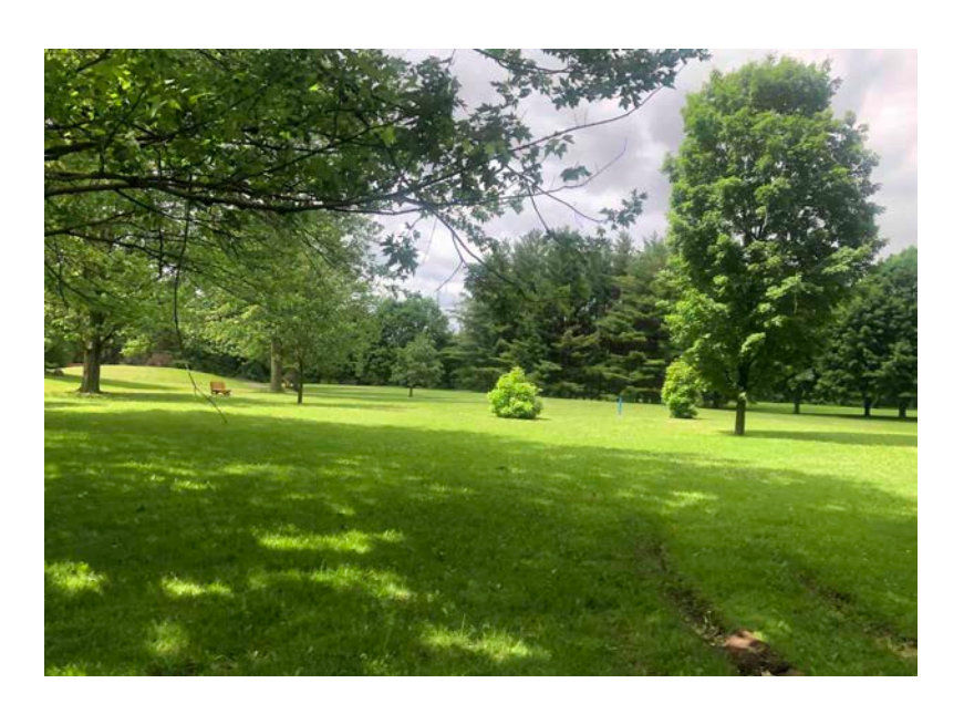
Plate 5 Shows conditions for test pit survey.