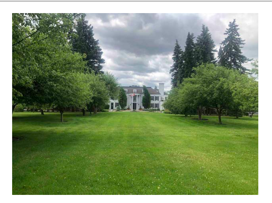
Plate 3 Shows conditions for test pit survey.