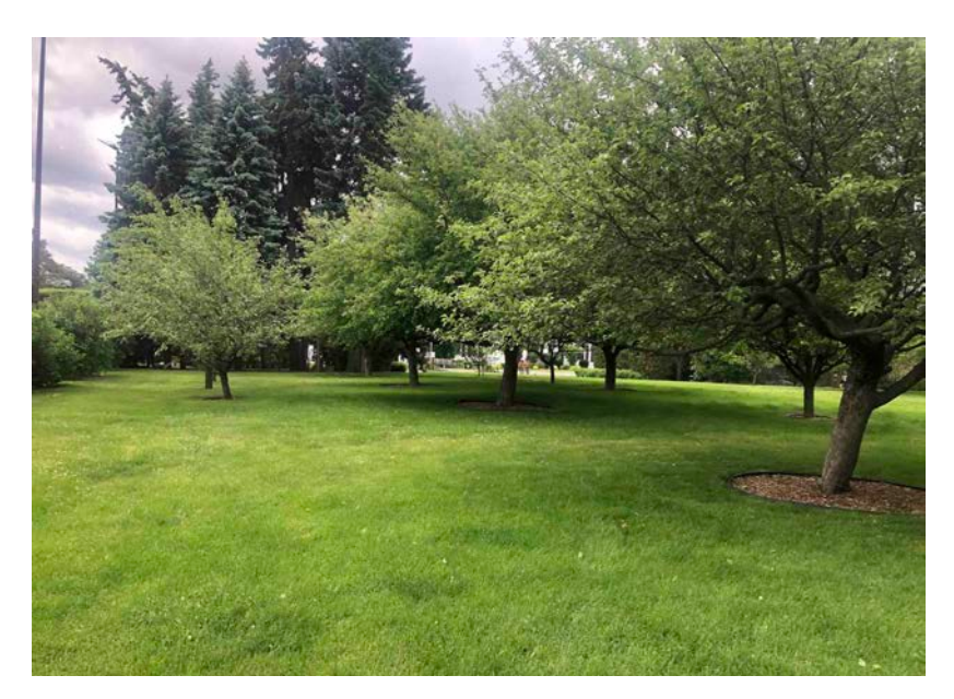
Plate 2 Shows conditions for test pit survey.