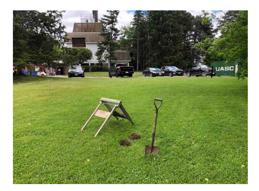
Plate 10 Shows conditions for test pit survey.