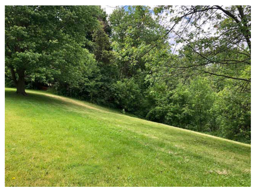
Plate 11 Shows conditions for test pit survey.