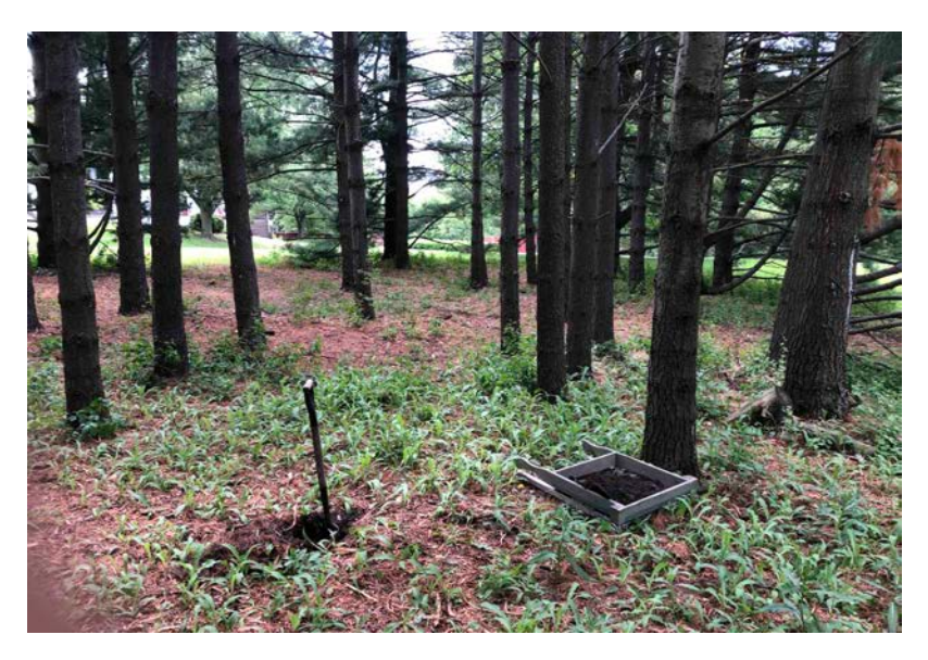
Plate 9 Shows conditions for test pit survey.