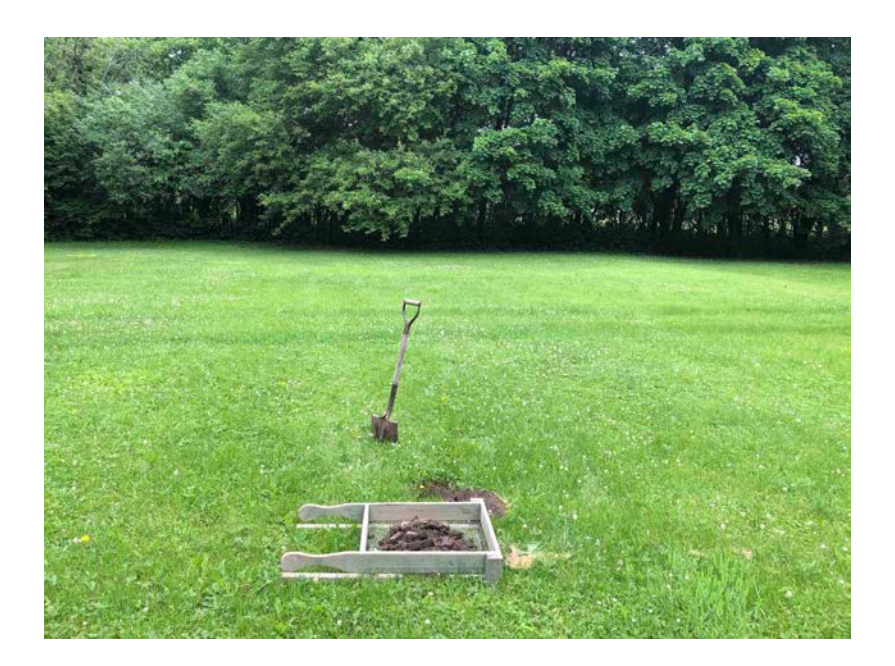
Plate 6 Shows conditions for test pit survey.

Plate 5 Shows conditions for test pit survey.