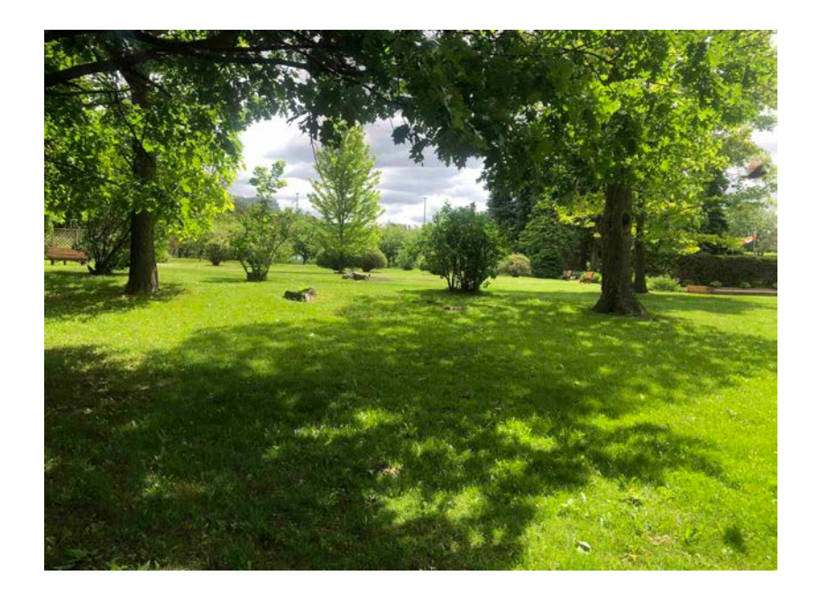
Plate 4 Shows conditions for test pit survey.

Plate 3 Shows conditions for test pit survey.