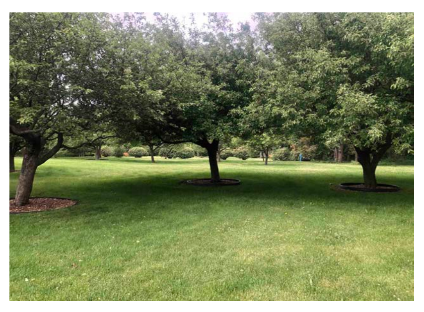
Plate 1 Shows conditions for test pit survey.

8.0 IMAGES (Sections 7.5.11, 7.7.5, 7.8.6)