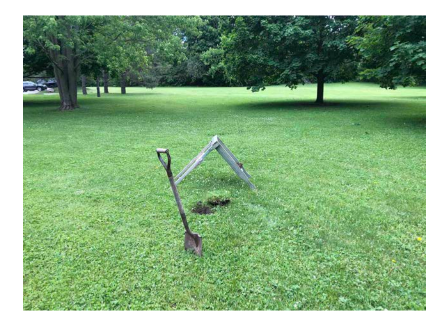
Plate 8 Shows conditions for test pit survey.