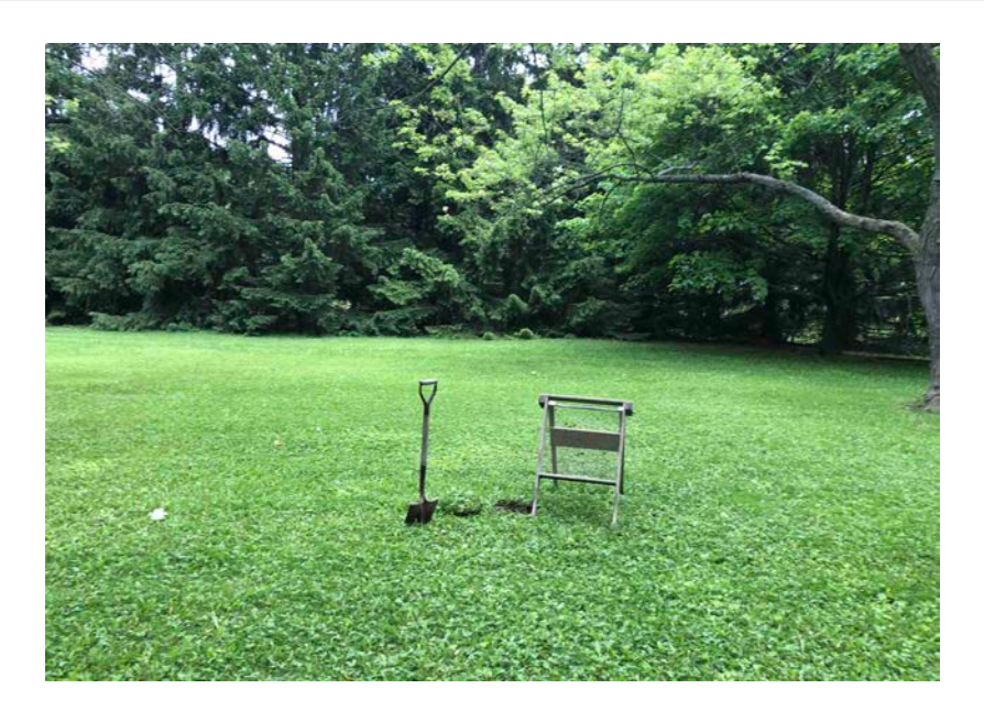
Plate 7 Shows conditions for test pit survey.