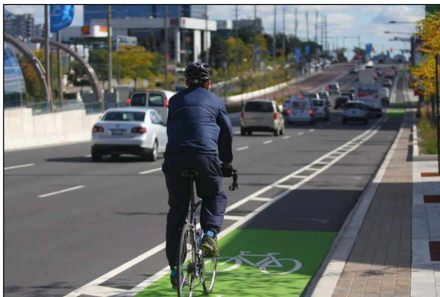
Figure 1 Cycling Lanes on Highway 7 at West Beaver Creek/Commerce Valley Drive

The sections of Regional roads to be designated as bicycle lanes are shown in Table 3.