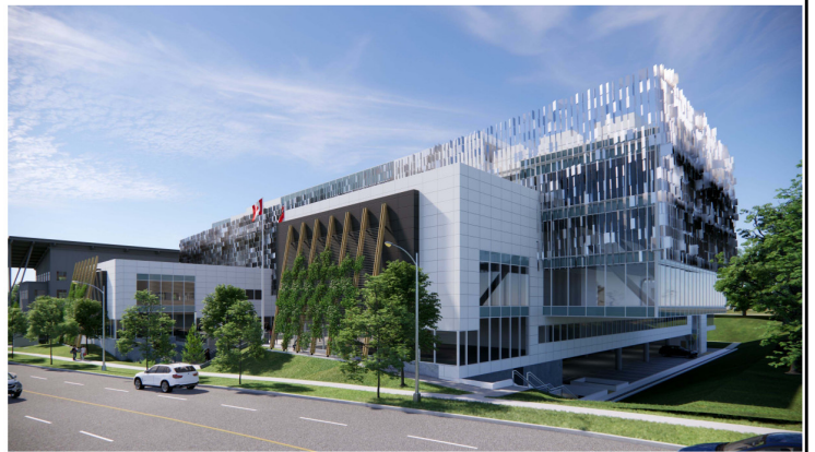
NORTH EAST PERSPECTIVE