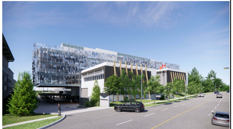
SOUTH EAST PERSPECTIVE