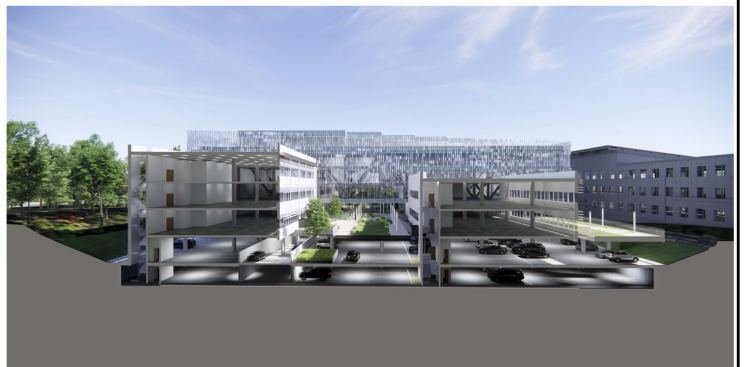
NORTH-SOUTH SECTIONAL PERSPECTIVE