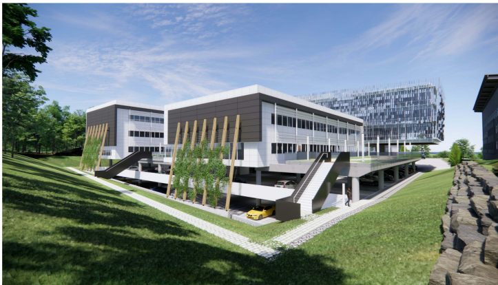
NORTH WEST PERSPECTIVE