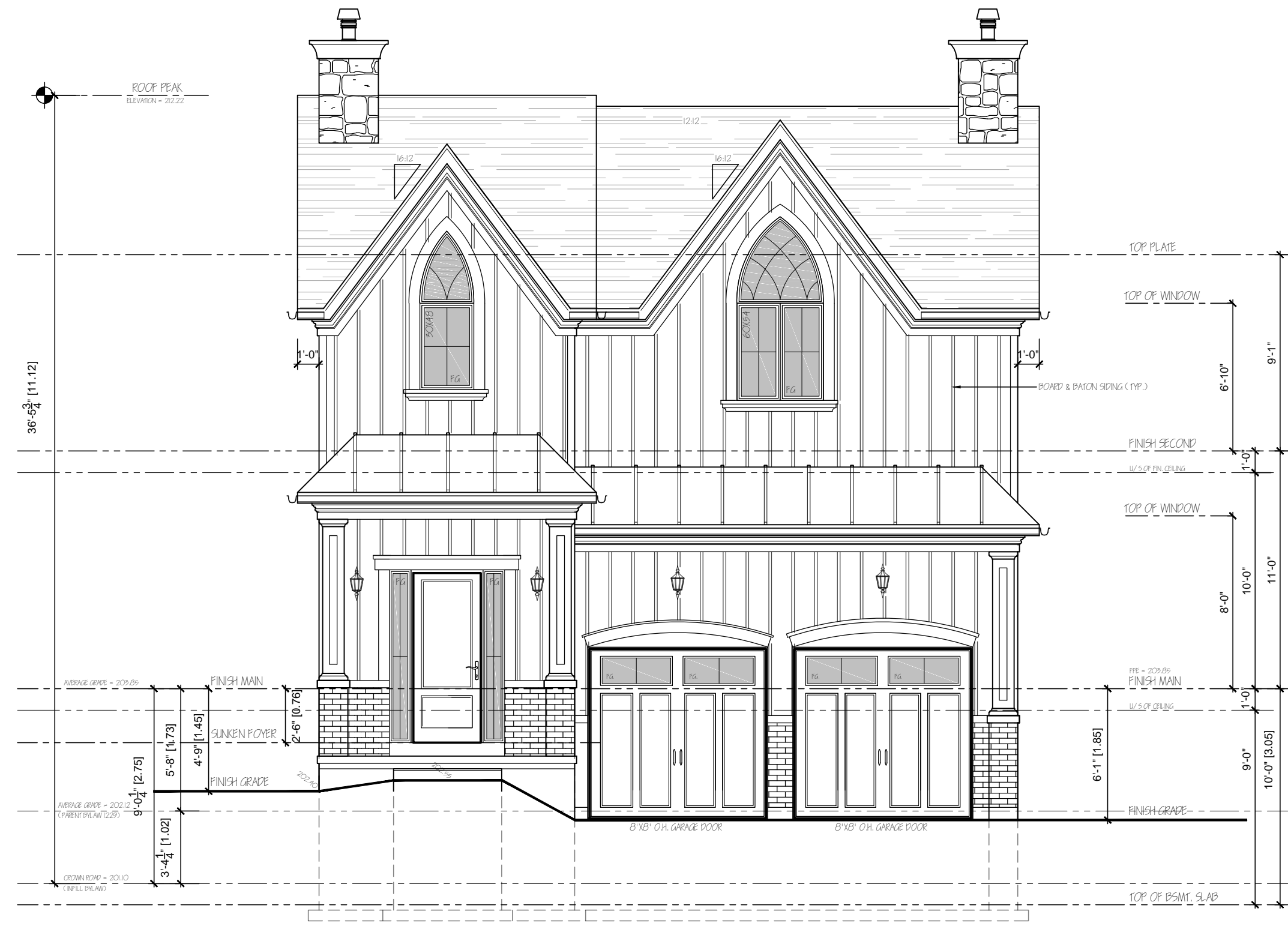
PROPOSED FRONT ELEVATION LOT 5 SCALE: AS SHOWN

PG. CONTENT: ELEVATION CONCEPT SCALE: 3/16" = 1'-0" PAGE: AI