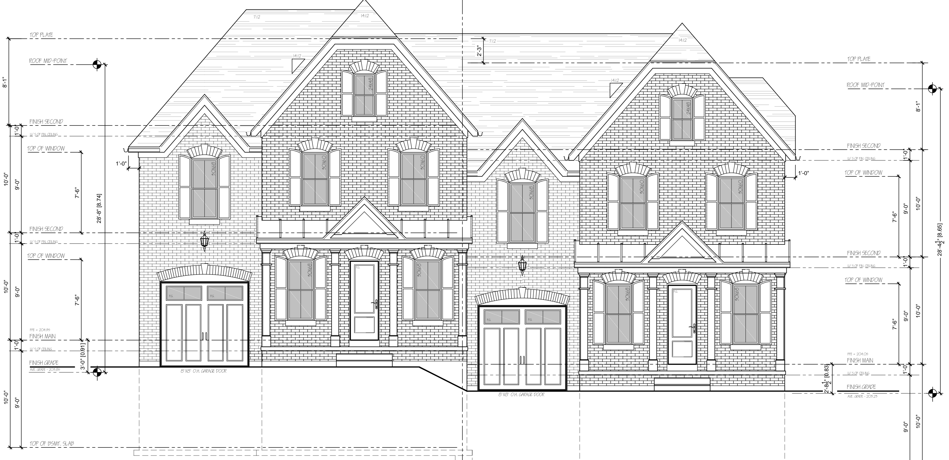
PROPOSED FRONT ELEVATION LOT 3 SCALE: AS SHOWN