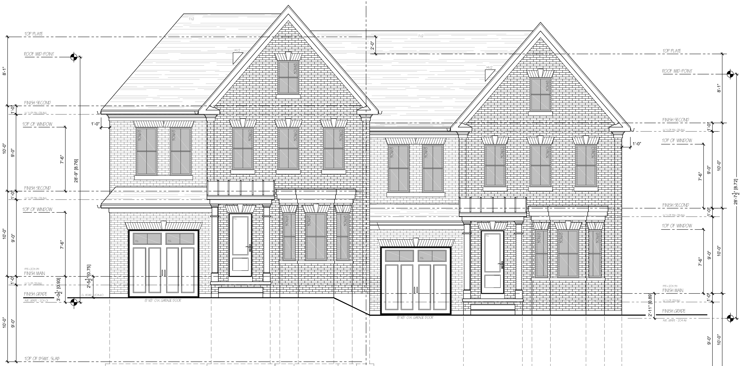
PROPOSED FRONT ELEVATION LOT 1 SCALE: AS SHOWN