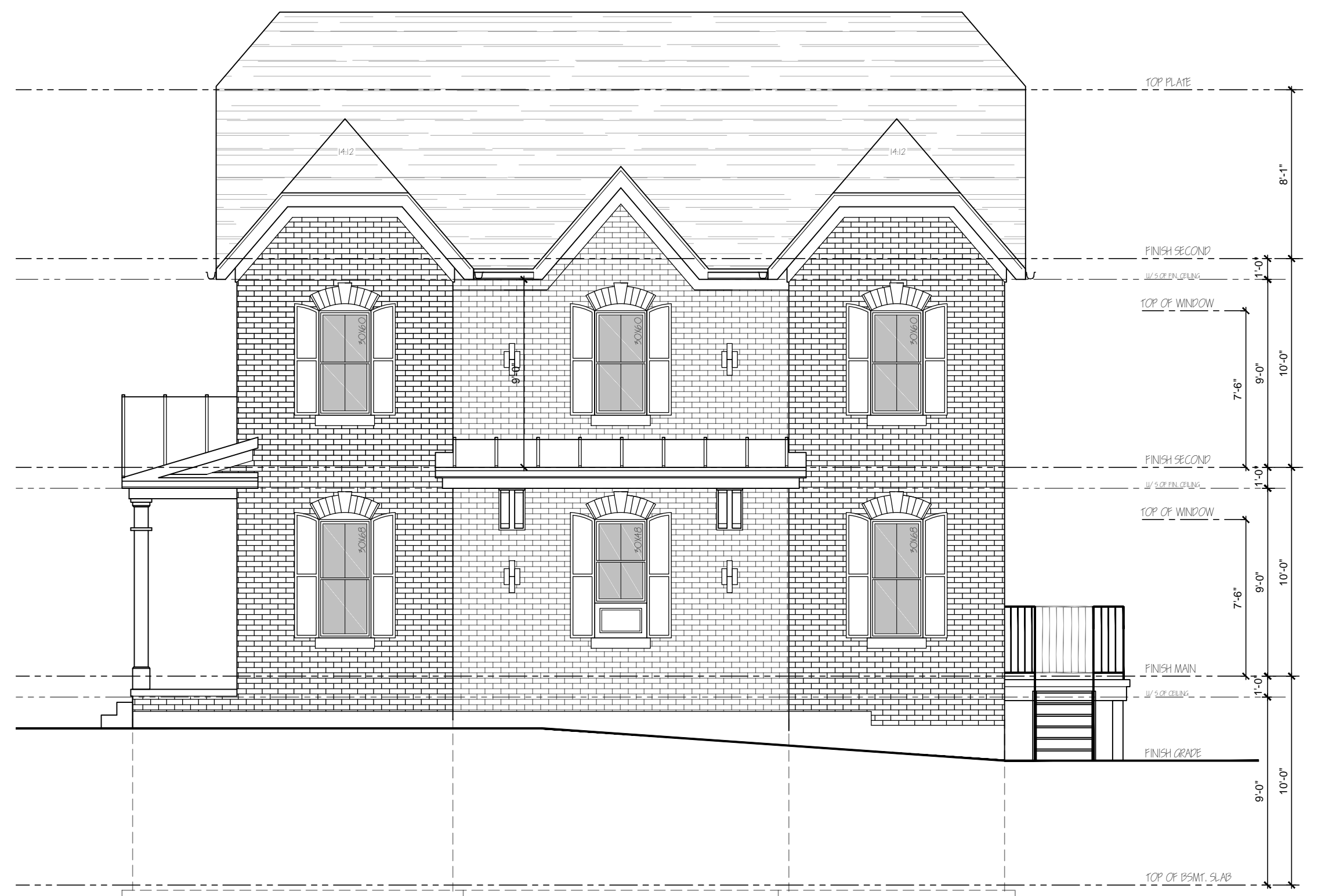
PROPOSED FRONT ELEVATION LOT 4 (CORNER UPGRADE) SCALE: AS SHOWN