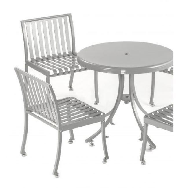
CAT-050 is constructed with steel.