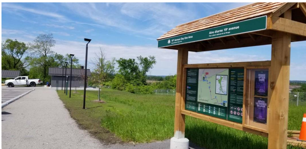
Figure 5 19 th Avenue Trailhead Sign and Park Amenities

Parks Canada has identified the need for the four proposed pedestrian signals as part of a 10 kilometre trail network expansion in York Region, scheduled to be completed in 2021. The connection will form a link from the Bob Hunter area to Boyles Cemetery. The expansion forms part of connections within the Rouge National Urban Park trail system to park amenities, nearby attractions and green spaces and local and Regional trail and cycling networks. Figure 5 illustrates the 19 th Avenue trailhead sign and park amenities.