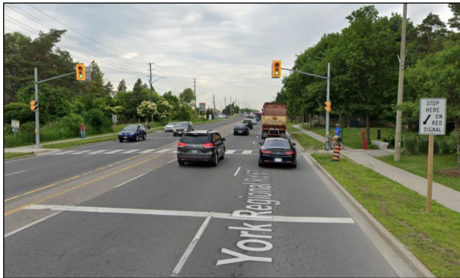
McCowan Road south of Highway 7