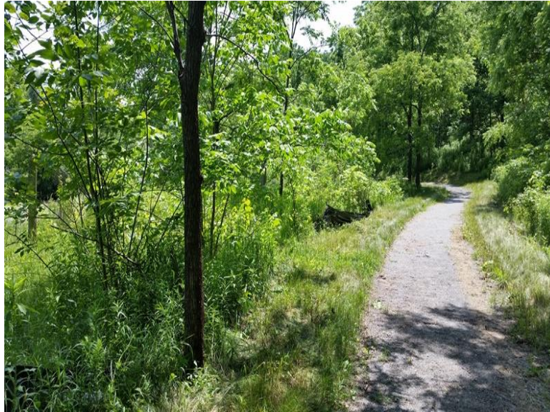
Figure 4 Trail Along Little Rouge Creek in Rouge National Urban Park

Parks Canada has identified the need for the four proposed pedestrian signals as part of a 10 kilometre trail network expansion in York Region, scheduled to be completed in 2021. The connection will form a link from the Bob Hunter area to Boyles Cemetery. The expansion forms part of connections within the Rouge National Urban Park trail system to park amenities, nearby attractions and green spaces and local and Regional trail and cycling networks. Figure 5 illustrates the 19 th Avenue trailhead sign and park amenities.