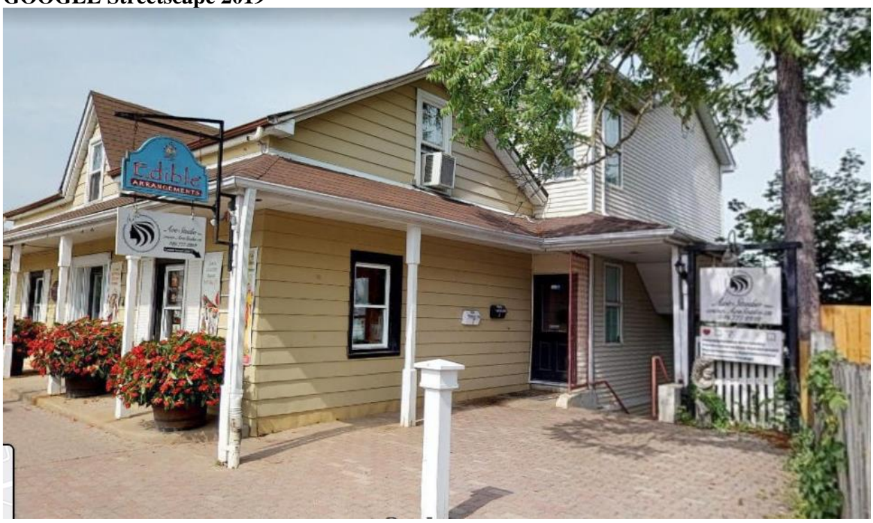
Photograph of Proposed Sign Design