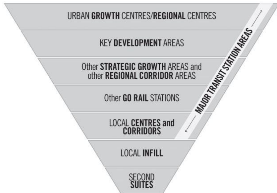
Figure 1 - York Region's Updated Intensification Matrix

The focus of intensification in centres and corridors served by higher order transit in Markham is reflected in Map 2 – Centres and Corridors and Transit Network in the Official Plan 2014, as shown in Appendix ‘A’. These intensification areas are identified as Regional Centres, Regional Corridors/Key Development Areas (KDAs), and Local Centres and Corridors. The two Regional Centres – Markham Centre and Langstaff Gateway – are anticipated to accommodate the largest share of intensification, followed by KDAs along the Yonge Street and Highway 7 Rapid Transit Corridors, and Local Centres and Corridors. Markham staff support the principle of continuing to focus growth in centres and corridors served by higher order transit, particularly within MTSAs, as reflected in the updated matrix.