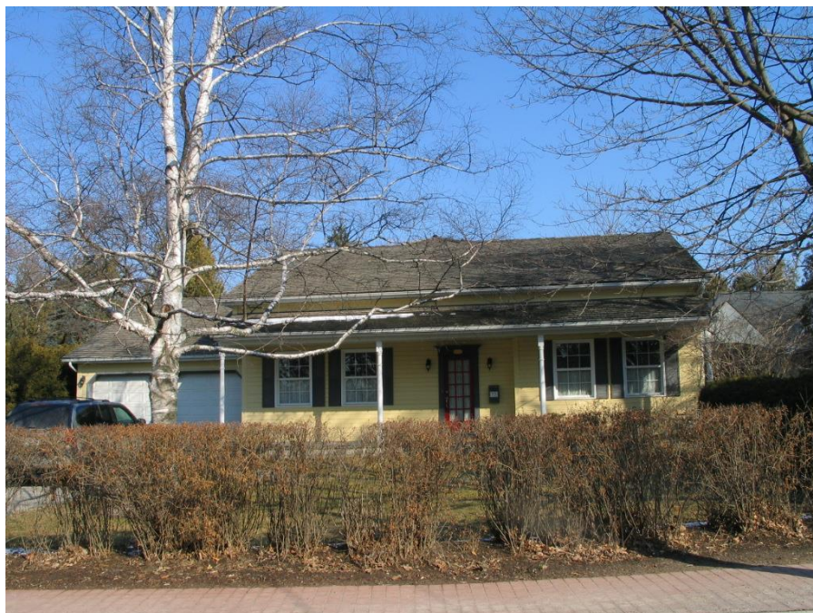
32 Colborne Street