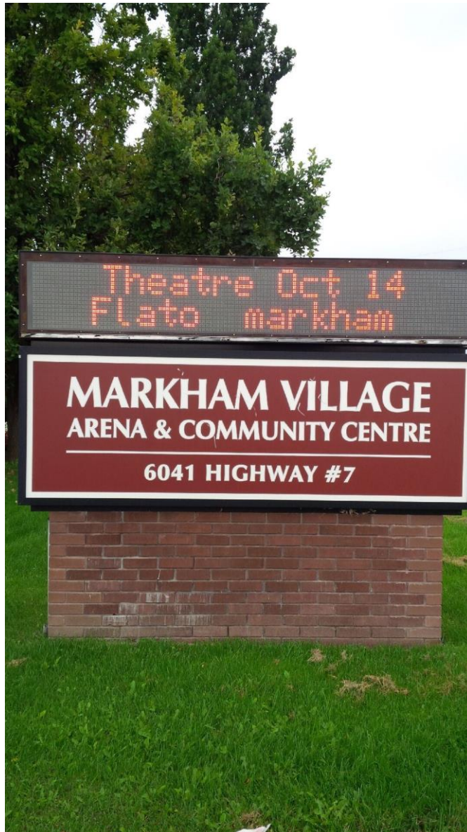
Existing Ground Sign at the Markham Village Community Centre 6041 Highway 7 East