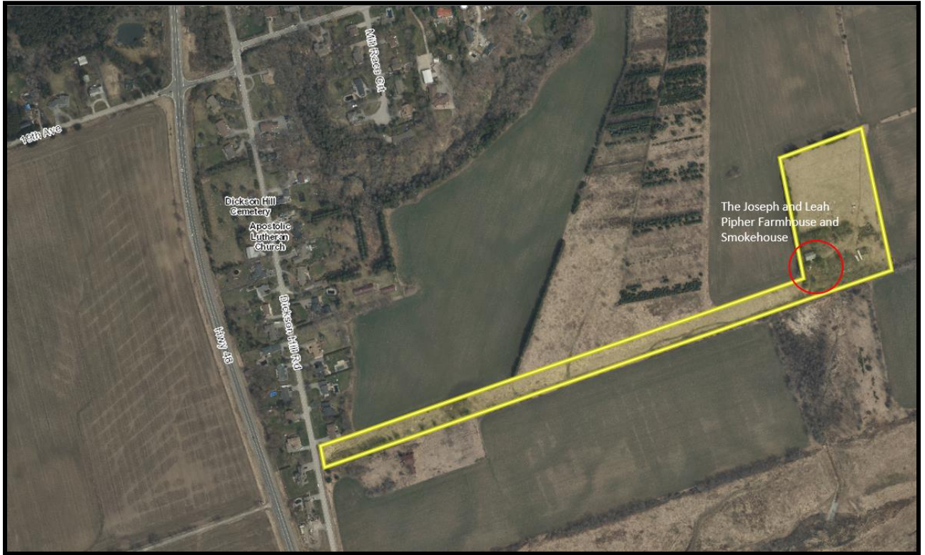
FIGURE 2 - Aerial Map