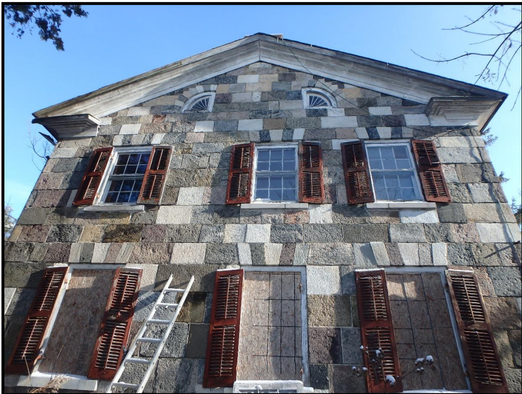
FIGURE 4 – Photograph of the Joseph and Leah Pipher Smokehouse