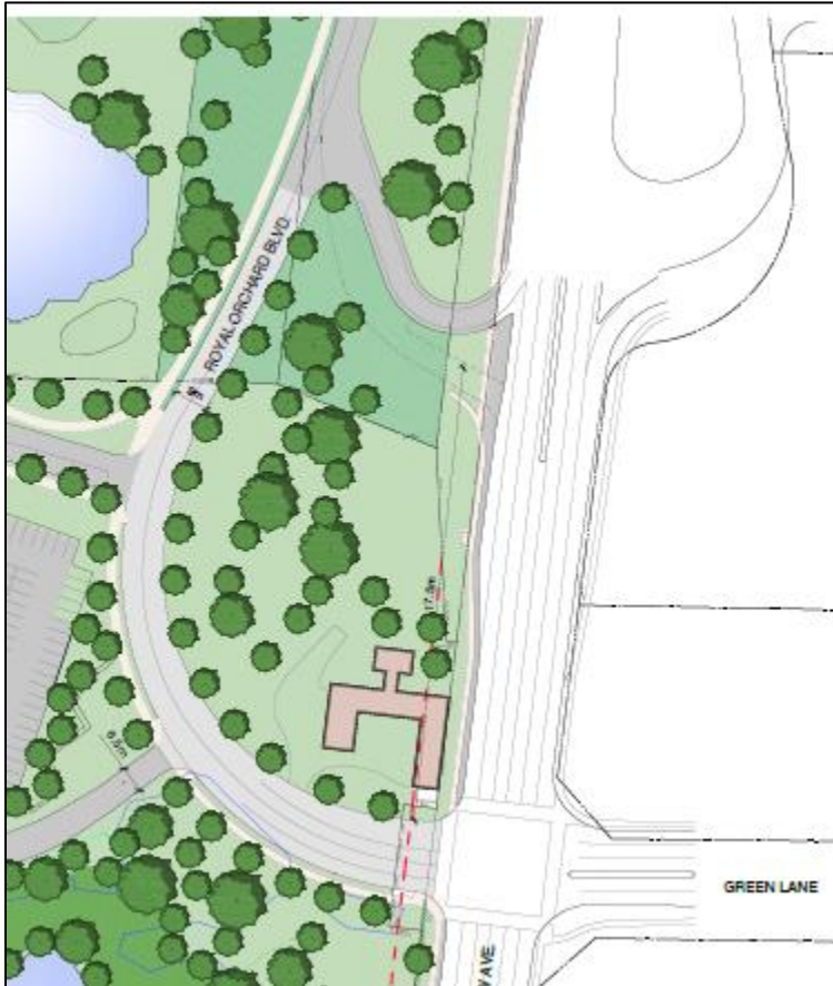
Figure 2: Conceptual Re-Alignment and Extension of Royal Orchard Boulevard West Ramp