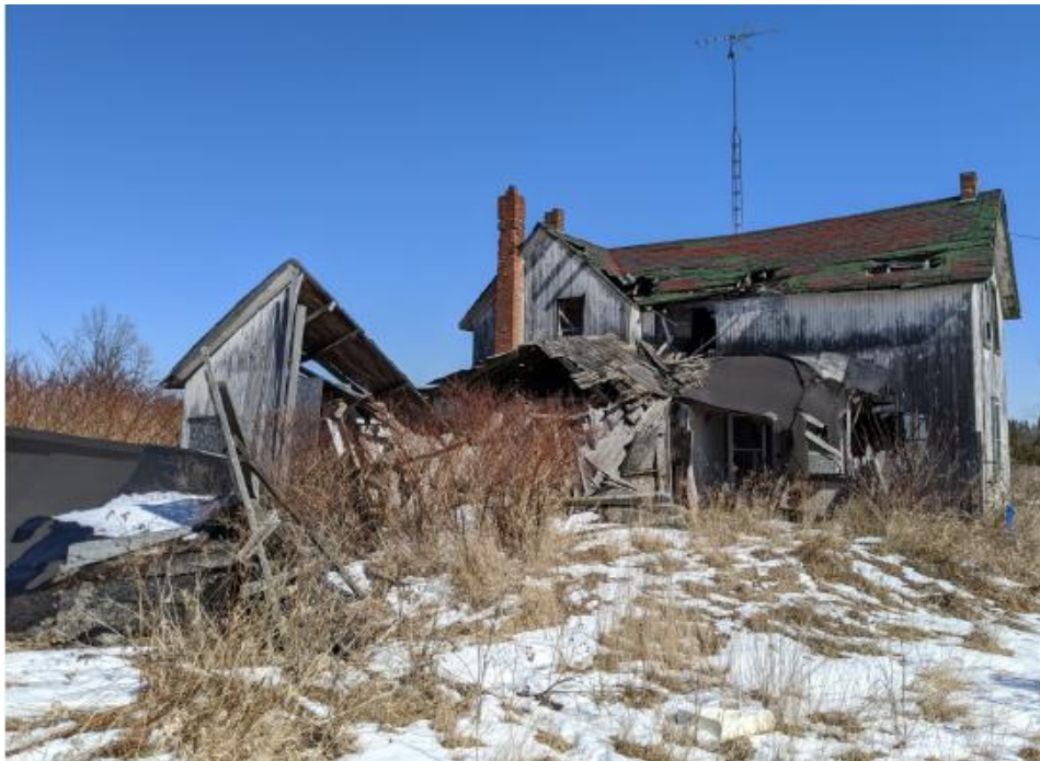
Front and rear of building, 2020. TACOMA Engineering Photographs