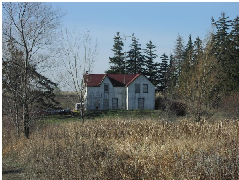
Building Photograph 2000