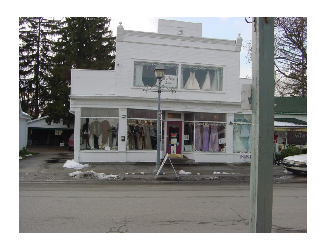
156 Main Street, Unionville showing leaded glass transom windows on storefront prior to alteration