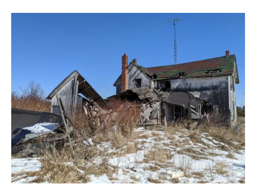
Rear of Summerfeldt-Stickley House, 2020