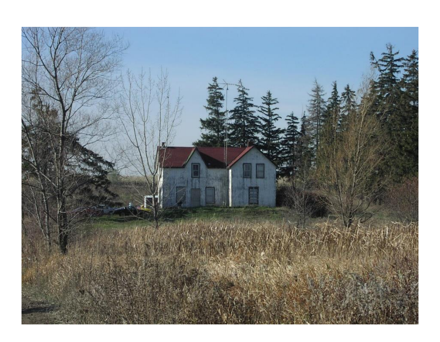
Summerfeldt-Stickley House in 2000 and 2020