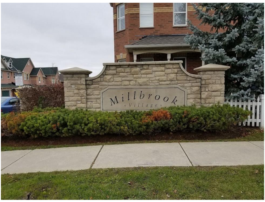
Figure 6: 16 Natasha Way & Woodbine Ave (21-25 years)