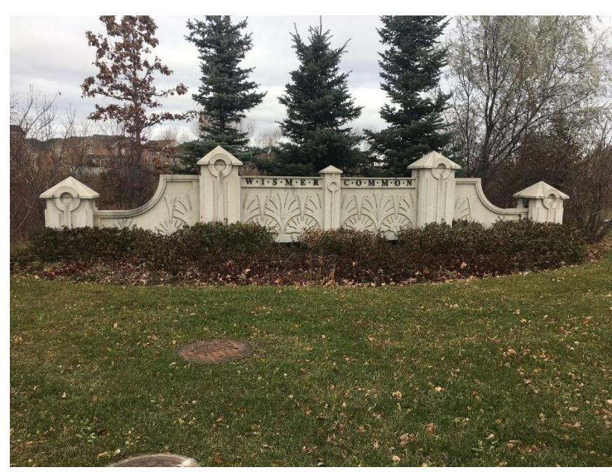
Figure 5: Roy Rainey Ave & 16th Ave (16-20 years)

Report to: General Committee Meeting Date: March 23, 2020