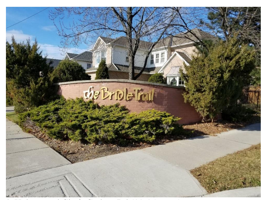
Figure 4: Halterwood Cir & Carlton Rd (11-15 years)