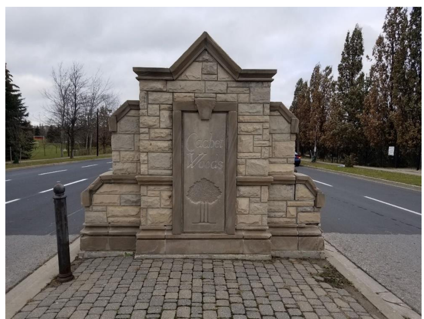
Figure 3: Woodbine Ave & Calvert Rd (6-10 years)

Report to: General Committee Meeting Date: March 23, 2020