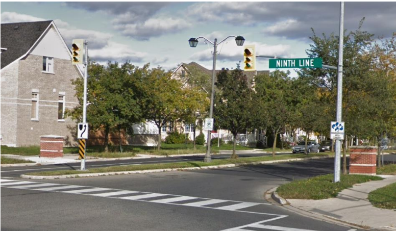
Figure 10: White's Hill Ave at 9th Line - After