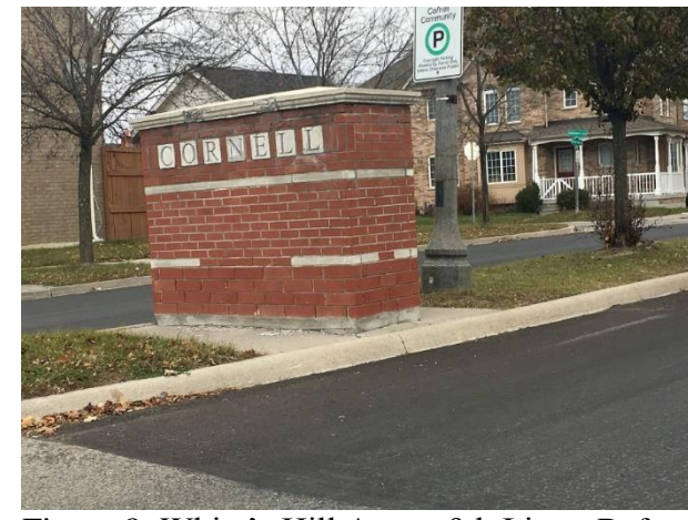
Figure 8: White's Hill Ave at 9th Line - Before

Both of these features had significant damage to their tops and were missing bricks. These two features were also blocking the sight lines when approaching 9<sup>th</sup> Line, putting pedestrians in danger. Operations removed both in 2018 and restored the sites with interlock pavers and sod.