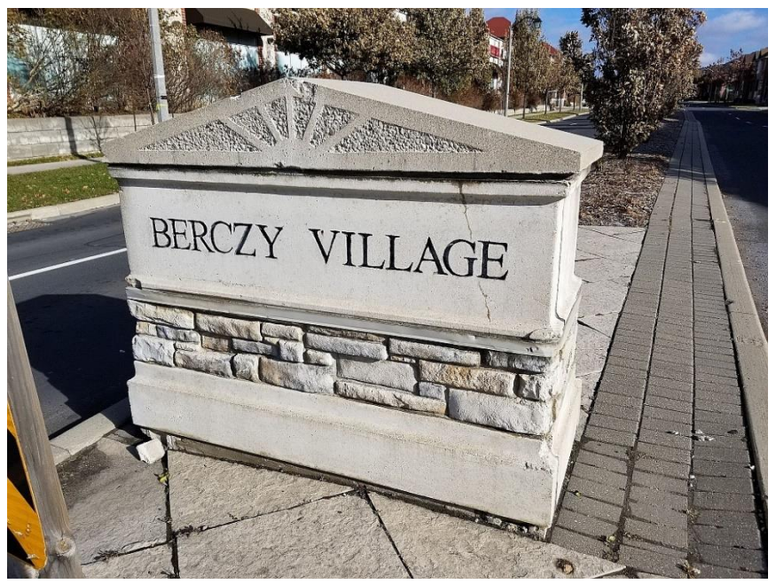
Figure 2: Bur Oak Ave & Kennedy Rd (1-5 years)