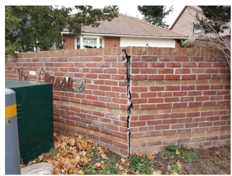
Figure 1: Montgomery Crt & Hwy 7 (immediate replacement)

The following photographs of entrance features provide examples from each of the condition categories, and an example of a removal.