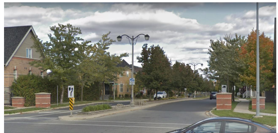
Figure 9: Cornell Park Ave at 9th Line - After

Both of these features had significant damage to their tops and were missing bricks. These two features were also blocking the sight lines when approaching 9<sup>th</sup> Line, putting pedestrians in danger. Operations removed both in 2018 and restored the sites with interlock pavers and sod.