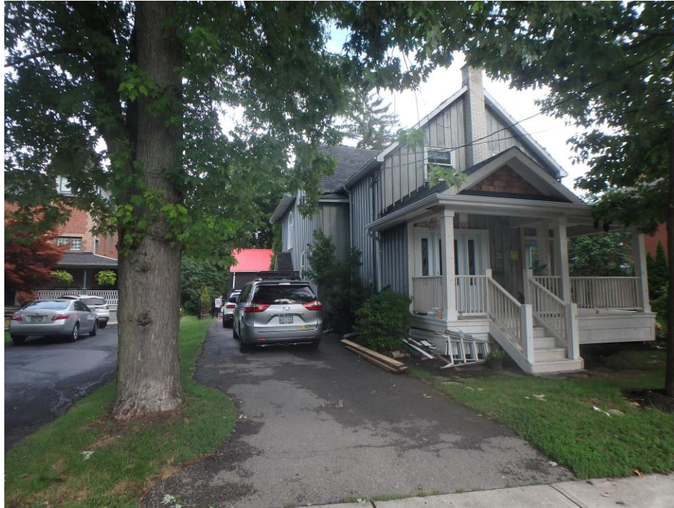
Street View and Close-up of the Accessory Building at 31 Wales Ave.