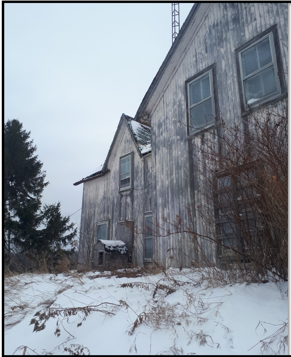
View of the front façade looking south west.