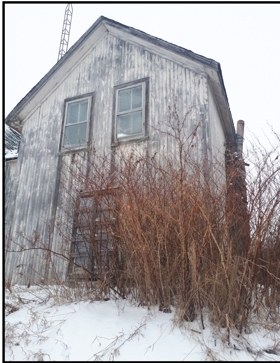
Detailed view of right side of front façade (east elevation).