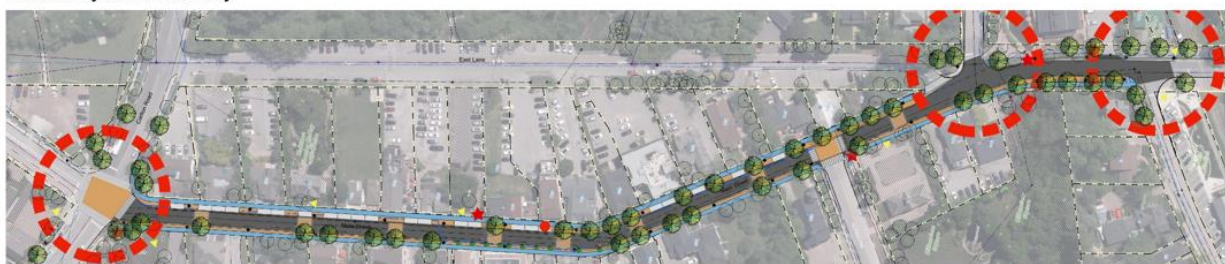
Main Street Unionville Streetscape