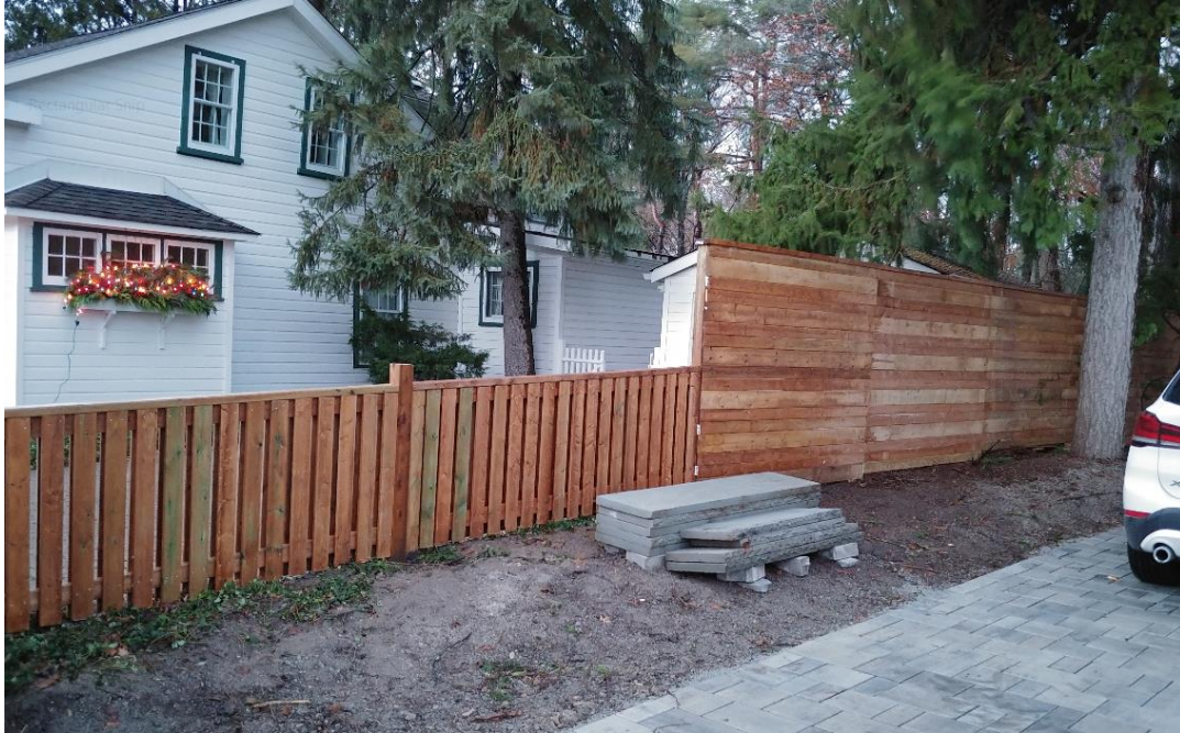
New Front and Side Yard Fences at 30 Colborne Street