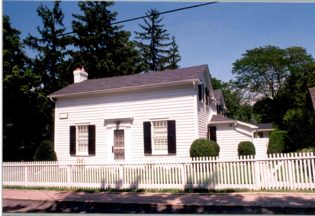
Previous Picket Fence at 30 Colborne Street (above), New Fence, Below