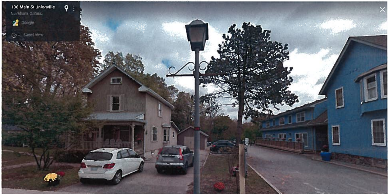
Google Street View showing the residential appearance of 107 Main Street, from Main Street Unionville. The parking lots can be seen from Highway 7 (below)