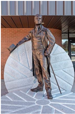
Monument to Benjamin Thorne