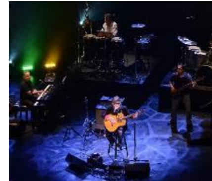
Arts & Culture